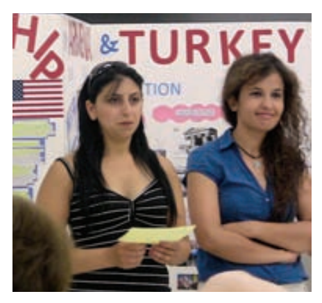
Turkish and Armenian teachers present a project before the group.

The focus was largely on how to help the teachers bring more student-centered learning to their classrooms. All were middle and high school English teachers in either Armenia or Turkey. Embedded in the professional development institute was a goal of allowing educators from countries with a long history of strained relations to learn about each other.