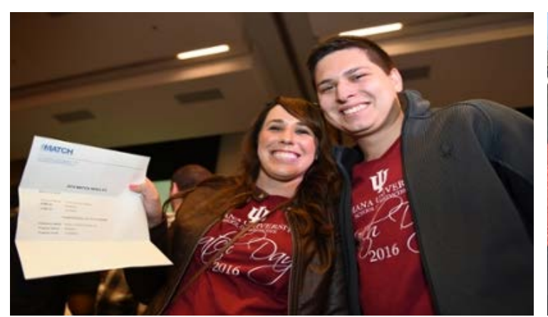
Anticipation, excitement fuel Match Day