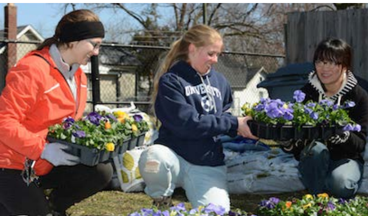
21st annual Spring House Calls to take place April 2