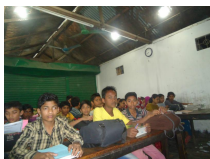
Studying under the solar light!

For the last 26 years, the NLJ OBAT high school has faced serious lighting issues. This has greatly hampered the educational process for the students in these classrooms. In order to address this issue, the OBAT think tank collaborated with a youth organization called CHANGE. Together, they constructed 28 bottle lights within two days for the school. Solar bottles are simple, cost efficient devices that can be built of scrap tin, roof tiles and empty plastic bottles filled with water. The construction is then integrated into the roof and sealed with water proof glue. Through light refraction, the sunlight is then channeled into the buildings. Approximately 1,000 students will benefit from these bottled lights. In addition, this opens up the possibility for local families to hold different festivals at the school such as wedding ceremonies and receptions.