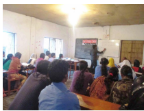
Students at the new tutoring center

A new tutoring center has opened in Syedpur, making the new total number of tutoring centers run by OBAT five. The plan is to gradually grow the center. At present, it offers tutoring to 8th grade students who need to pass their JSC (Junior School Certificate) exam. In April, a new class will be added for 5th grade students who need help with preparing for the PSC (Primary School Certificate) exam.