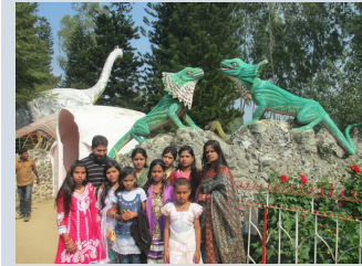
Rangpur students at the park

These stellar performers in the picture above are students of OBAT's Rangpur School who have achieved extraordinary academics! In the PSC (Primary/elementary School Certificate) exams, 40% of the Rangpur School students got an A+, another 40% got an A and 20% received an A-. As a reward for an excellent performance among other government and private schools, the students earned a trip to Swapna Puri, the City of Dreams Park. Congrats students!