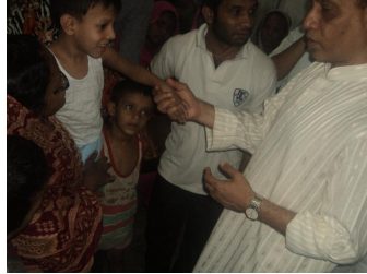
Disabled to Able

The OBAT Think Tank is gaining momentum and churning out new projects to aid the camp environment and its people. Due to widespread disconnect, many camp residents are unaware of some the facilities that are offered by the government. Among them is providing a monthly allowance, free medical facilities, general education and vocational training to autistic people. In the project, "Disable to Able," one hundred members of OBAT's Think tank will go door to door in six different camps in Mohammadpur, Dhaka to collect data on autistic individuals and dispense information on government facilities available for them. Bangladesh Social Welfare Organization (Ministry of Social Welfare) will partner with OBAT Think Tank to collect this data which maintains information about such individuals.