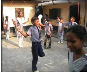
Students enjoying recess at SB Nagar school