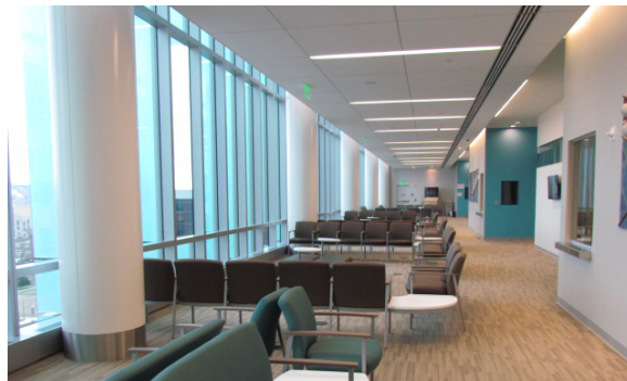
Reception area at the new eye clinic at Eskenazi Health