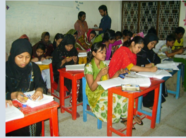
Students at Dhaka tutoring center

In early May, the Secondary School Certificate exams results were announced. Out of the 16 candidates taking the exam from OBAT's Dhaka Tutoring center, 68% received an A or an A-. Out of the 10 candidates from OBAT's Mymensingh Tutoring Center, 60% received an A or an A- grade. Congrats to our brilliant students!