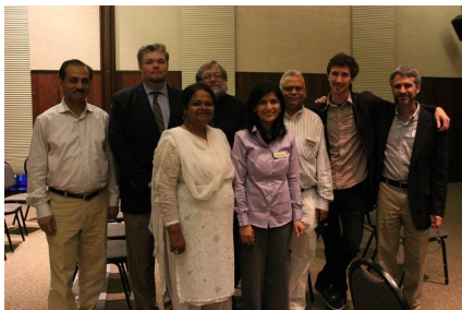
A big thanks from our team for a wonderful night!