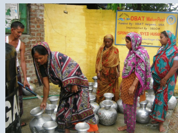
Women collecting water from tube well

A tube well at the Sardar Bahadur Nagar camp is the latest addition to OBAT's drinking water projects. People in this camp have been suffering from a dearth of clean water for the past 42 years. Now, 150 families will have access to clean water obtained from this tube well. According to an elderly camp resident, "When any guests visited us, we offered them food and a place to sleep but they could not bathe here due to the serious crises of water."