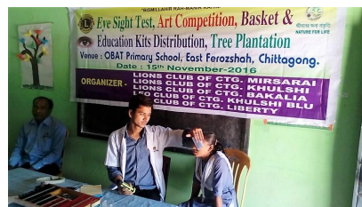
Student undergoing an eye exam

In mid November, Lions Club International organized some projects at OBAT's Ferozeshah School. These projects included, an eye exam, an art competition, donation of waste baskets to each class, distribution of school supplies to PSC exam students and plantation of trees in the school compound.