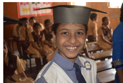
A PEC student from Halishaher School at her graduation party.

PEC (Primary Education Certificate), a public exam (it is essential to be taken by elementary school students to continue their education) was held all over Bangladesh from November 20th. More than three millions students took the exam from throughout the country. This year, a total of 308 students from OBAT's educational projects including schools and tutoring centers took the exam. OBAT held farewell/graduation parties for students graduating from its primary schools.