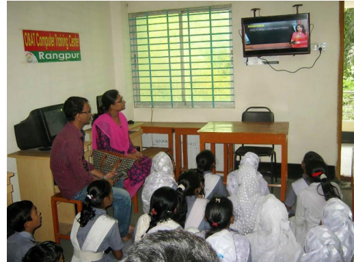
Students watch a lecture

A new LED screen now adorns one of the walls of the Rangpur School. It is a part of a digital media pilot program that will eventually be launched at other educational programs as well. The government of Bangladesh has converted some text books into a digital format. The teachers of grades one and two have participated in training focused on teaching through digital media class. So far, the program has been successful as it has also invited more enthusiasm from the students.