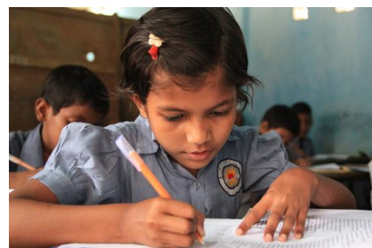
A student at OBAT's School

The end of 2016 marks twelve years that OBAT has been consistently working for the camp residents! So much good has happened in these last twelve years - it would be hard to count our blessings in this small space. For now, let's focus on what you helped us achieve in 2016: