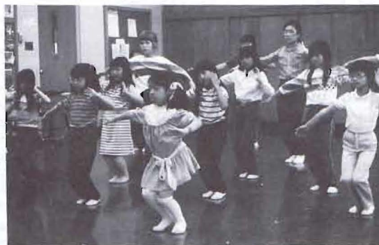
The Korean School meets on Sundays, 3 to 5 p.m., and enrolls 33 children and 5 adults.