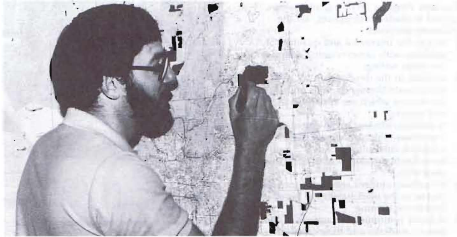
A geography intern identifies failing septic systems on the map of Indianapolis.