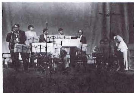
The IU/PUI Jazz Ensemble presents its annual spring concert.

EDUC M323 Teaching of Music in the Elementary School (2 cr.) P: MUS E241 or permission of instructor. Music methods for elementary education majors.