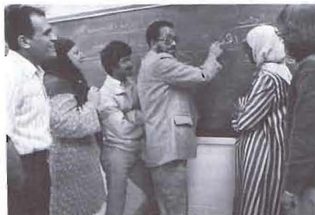
Ten foreign languages are offered at IUPUI. Here, an associate instructor teaches the second course in Elementary Arabic.

Introduction to contemporary Russian and aspects of Russian culture. Intensive drill and exercises in basic structure; development of vocabulary. First contact with Russian expository prose.