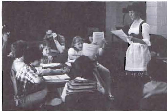
The German School meets on Saturdays, 9 to 11:15 a.m., and enrolls approximately 80 children and 20 adults.