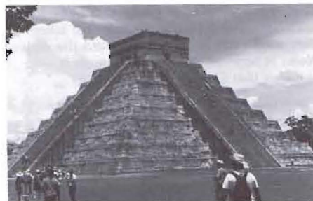
IUPUI students at El Castillo in Mexico.

As the anthropology program continues to develop, new courses will periodically be added to the curriculum, particularly in the areas of archeology and museum studies. Current information may be obtained from the departmental chairperson or secretary.