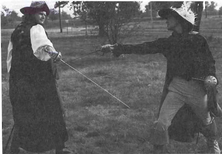
Swoashbucklers in The Three Musketeers open the 1983-84 season of the University Theatre with a fast action duel.

experience under auspices of a qualified cooperating organization. Periodic meetings with faculty advisers and term paper detailing intern's professional activities and reactions. Apply during semester prior to desired internship. Total credit applicable to graduation shall not exceed 9 credit hours of C300 and C491 combined.