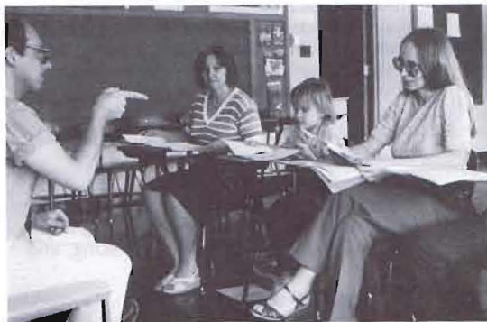
The Estonian School meets on Saturdays, 12:15 to 4 p.m., and enrolls between 10 and 15 children and adults.