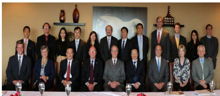
2013 Board of Directors' annual meeting