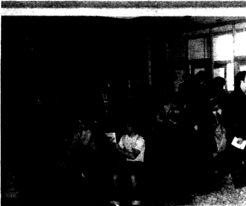
Long lines, again, were the fashion during advance registration this week. Many suggestions were made for improvements.