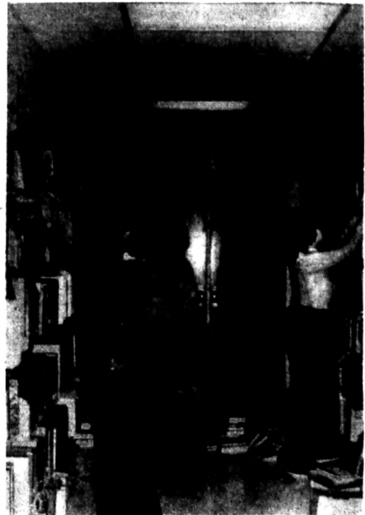
Members of the Accolade Senior Honor Society sort through the surplus library books they're collecting for their annual sale.