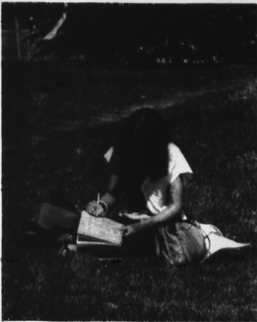
Just last week, students were able to do just as this studious young lady is doing here. Temperatures this week have made locations such as this "off limits" to the bare feet and Calvin Kleins.