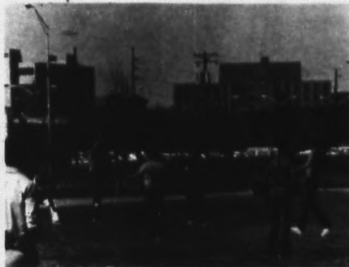
Last week, nice weather enabled students to take a break from classes to play a little football or throw a frisbee around. Temperatures plunged this week putting an end to the outdoor games.