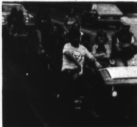
Last year's Walkathon participants wheel their way along North Meridian Street.