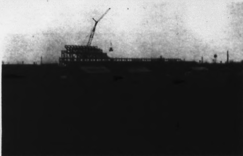
In the good ol' summertime, the newly-emerging natatorium and track and field stadium may well overflow with fans attending the National Sports Festival. Until then, construction still continues.