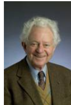
Nobel Laureate Dr. Leon Lederman

The Research Day provides an opportunity for the IUPUI faculty, staff, and students, and their academic, industrial, governmental partners, and the community at large, to come together and find out more about the research enterprise at IUPUI, explore new collaborations, and lay the foundation for new partnerships.