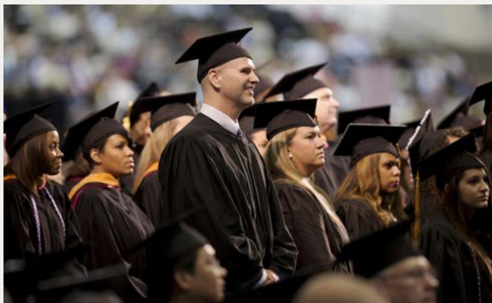
Excited IUPUI students watch classmates as they await their moment

For the record, the 6,547 graduates earned 6,633 degrees—5,241 from Indiana University and 1,392 from Purdue University. The graduates ranged from 19–69 years of age and included six sets of twins and even one set of triplets! Of the 723 Bachelor of Arts degrees, 114 were Psychology; while of the 604 Bachelor of Science degrees, 101 were in Computer and Information Technology.