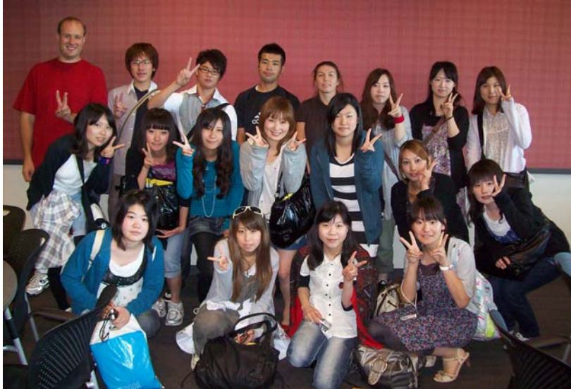
Students from Hakuoh University in Oyama, Japan, spent two weeks at ICIC this summer. IUPUI students also have the opportunity to study at Hakuoh under an exchange agreement between the two universities.