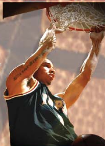
George Hill San Antonio Spurs

Located @ Riverside Park & Family Center (2420 East Riverside Dr.)