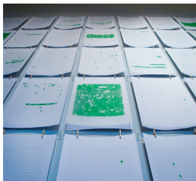
Human Nature courtesy of the artist