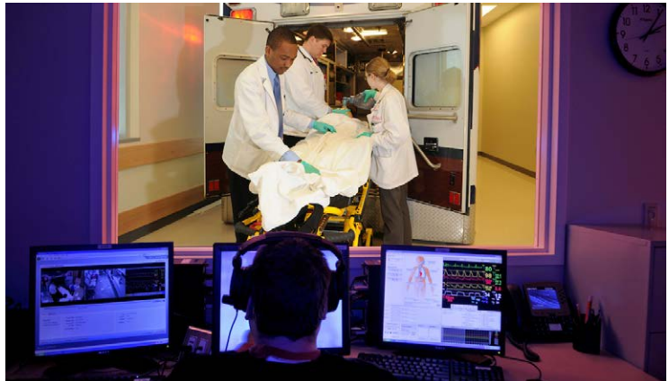
Sim Center undergoes AV refresh