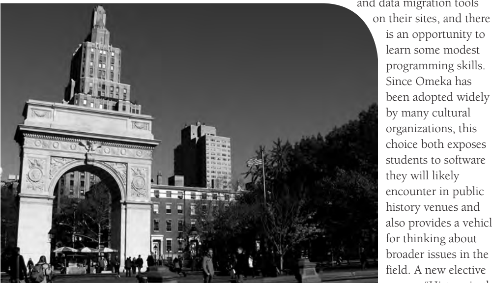
Washington Square Park, the heart of the NYU campus.

available online, as well as to manage and preserve born-digital materials. Public history professionals routinely integrate technology into their daily operations, work collaboratively and effectively with information technology staff without allowing support services to drive programs, and master techniques for educating and serving users remotely through web-based delivery systems.