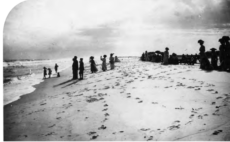
Late 19th-century view of Pensacola Beach.

The Annual Meeting Program and registration are available at ncph.org starting this month.