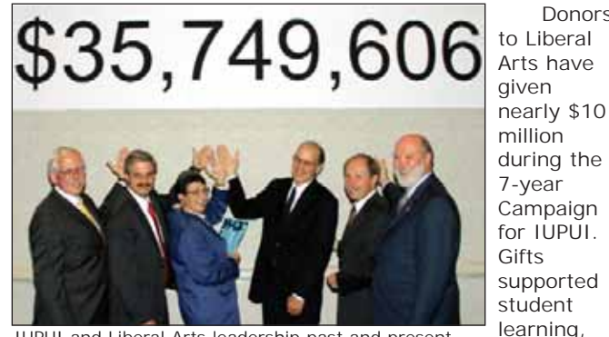
IUPUI and Liberal Arts leadership past and present celebrate the campaign's success on October 9th.

Two elements together resulted in over $35 million in support for the School of Liberal Arts-donor generosity and outstanding faculty research.