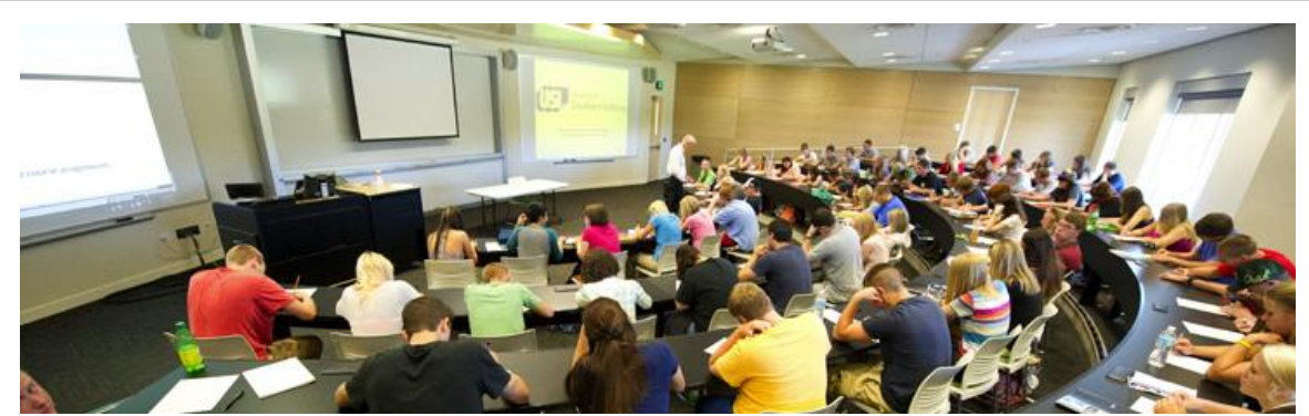
The University of Southern Indiana's vision is a simple but powerful one: Shaping the future through learning and innovation .

Its mission statement is: USI is an engaged learning community advancing education and knowledge, enhancing civic and cultural awareness, and fostering partnerships through comprehensive outreach programs. We prepare individuals to live wisely in a diverse and global community.