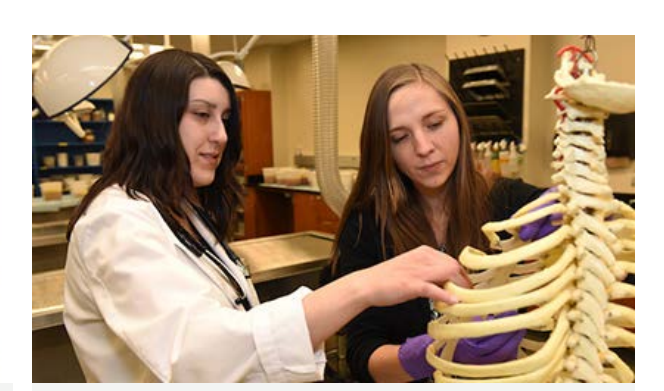
AAMC Graduation Questionnaire now online