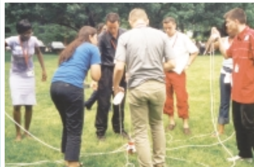
Group 7 working together to "dispose of toxic waste" in a leadership activity.

Student Quote: "...it went beyond what I had in mind."