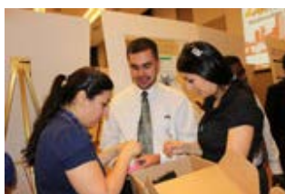
ITEC turns research into reality