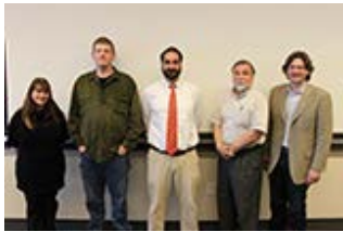
2013 MURI Team