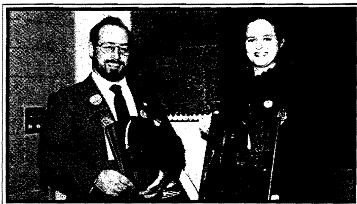
Pictured are representatives from Denmark, WI and New Lexington, OH receiving the second and first place affiliate awards.

The National FFA Alumni Convention Proceedings are being published as part of the newsletter so that all FFA Alumni can share the convention highlights. The Convention was held in Kansas City, Missouri, on November 12, 1986.