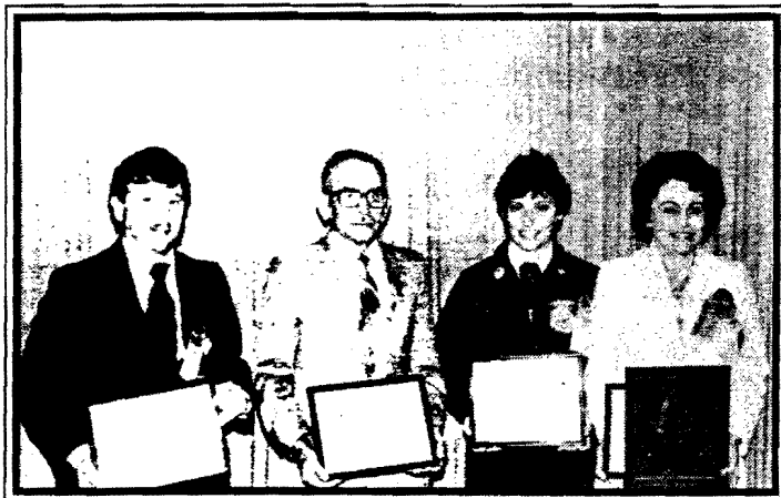
Pictured are representatives from the Gold Emblem scrapbook affiliates.