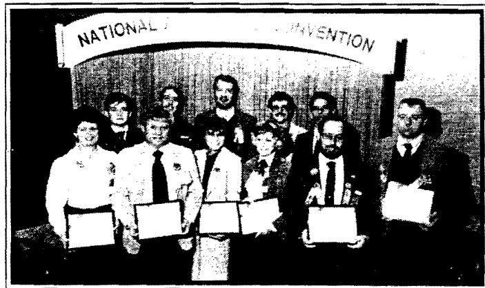
Pictured are representatives from our National Gold Emblem Affiliates holding their certificates and plaques.