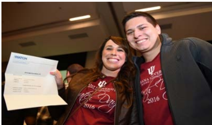
Anticipation, excitement fuel Match Day