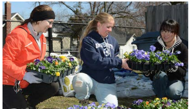
21st annual Spring House Calls to take place April 2