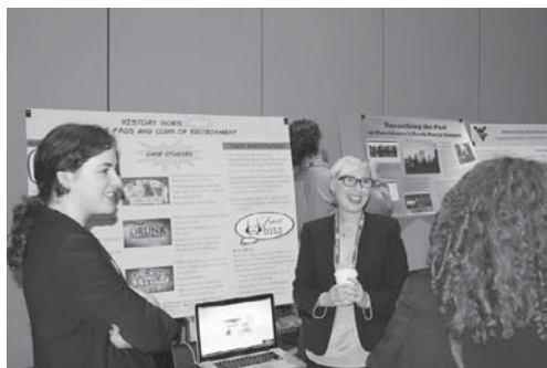
Poster Session and Reception.

About 48% of attendees responded to our post-meeting evaluation. Attendees reported loving the substantive conversations, strong sense of camaraderie, and close ties to the conference city that mark NCPH meetings. We heard that the meeting was energizing, and re-focused attendees on their work and scholarship.