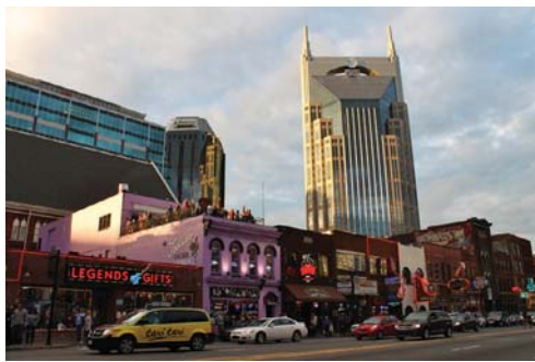
Participants enjoyed four days of exploring Music City on tours, and on their own.