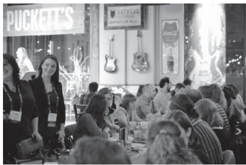
Participants gather at the New Professional/Graduate Student Social.