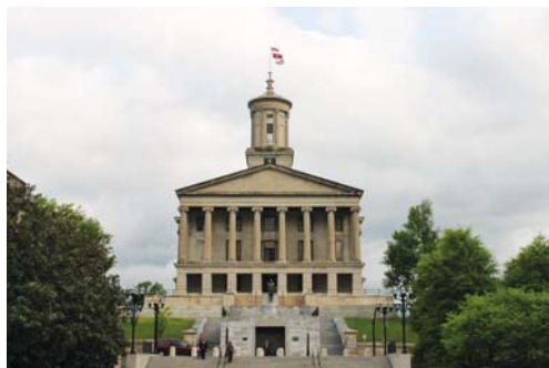
Our meeting hotel was located just one block from the Tennessee State Capitol.

Attendees also noticed that there were a lot of us. In many ways, NCPH's growth is a real boon to our annual meeting: it means more perspectives and more opportunities to advocate for public history. However, NCPH is not immune to growing pains. Sessions were crowded and sometimes difficult to hear; wait times for the elevators were high; as registration soared unprecedentedly high, so did demand for NCPH's block of rooms at the conference hotel. As NCPH plans for next year's meeting in Baltimore, we're cognizant of the need to make sure that attendees are comfortable, while accommodating our growing community of members, friends, and partners. We've renegotiated our Baltimore contract to increase our room reservations and meeting space, and continue to plan ways to keep the flexible, friendly feel of our meetings.