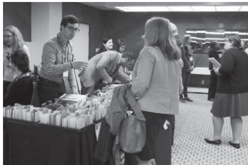
Attendees Check In at Registration.

Hundreds of public historians converged on Nashville, Tennessee, where NCPH held its 2015 Annual Meeting on April 15-18 to talk about “History on the Edge.” With over 800 registered attendees, this year’s meeting was NCPH’s largest ever – and not by a little. This conference represented a more than 30% increase from last year’s already-record-setting attendance of 609 in Monterey.