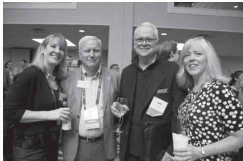
Attendees of the 2015 Annual Meeting in Nashville, Tennessee enjoy the Opening Reception on Wednesday evening, April 15.

About 48% of attendees responded to our post-meeting evaluation. Attendees reported loving the substantive conversations, strong sense of camaraderie, and close ties to the conference city that mark NCPH meetings. We heard that the meeting was energizing, and re-focused attendees on their work and scholarship.