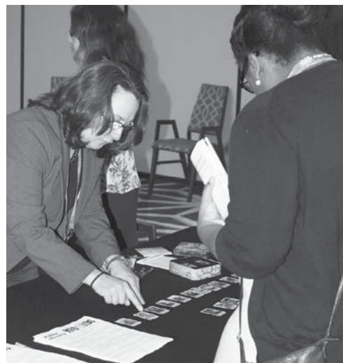
Pop-up Play Station games in Nashville.

While each activity represented a different kind of play, it became clear to us as co-facilitators that playing had actually prompted the members of our group, who had never met before, to connect with each other, making our conversation the next day during the working group session flow