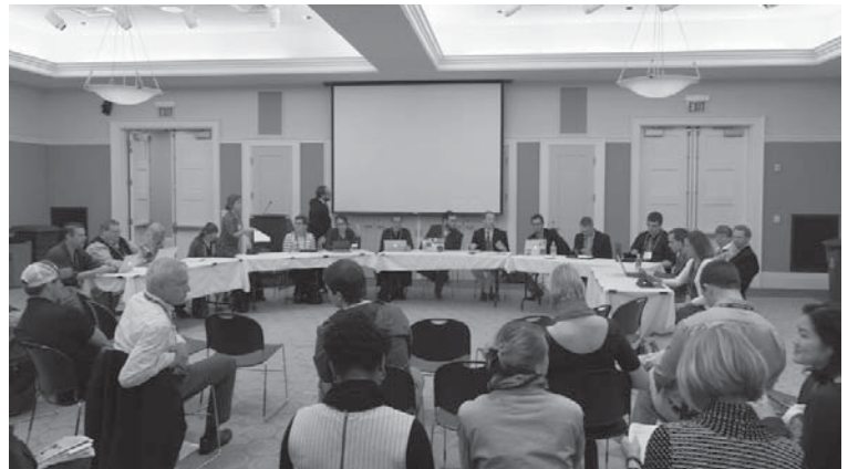
Public History as Digital History as Public History working group.

As public historians increasingly engage with digital history, our group convened at the conference to workshop the relationship between digital and public history. The goal was to bring together participants from a diversity of backgrounds -- faculty, graduate students, and public history practitioners -- to talk about their experiences working at the intersection of the two fields. The working group’s brief was to think about how best to define the relationship between digital and public history and how to train a rising generation of public and digital historians.