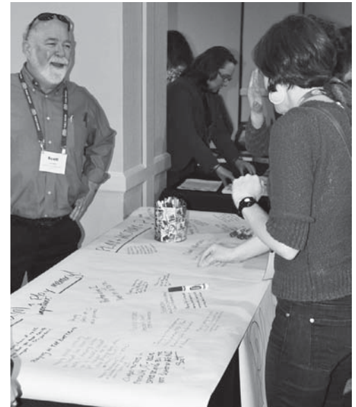
Memory Wall pop-up Play Station in Nashville Exhibit Hall.

At station two, we offered a blank Memory Wall, on which attendees could write down their memories of play and how it influenced their understandings of history. The wall prompted nostalgic conversations about childhood games and toys, and also more critical discussions of the differences between games and play and the utility of historically-minded play in developing historical consciousness.