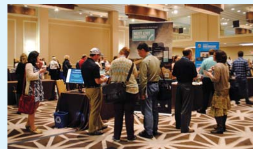
Attendees gather in the Exhibit Hall