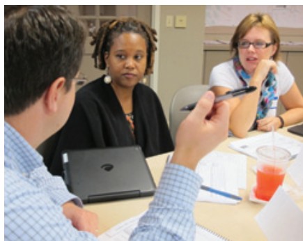
A session during the Equity Leaders Institute