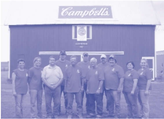
Illinois FFA Alumni members and National FFA Alumni staff proudly stand before the restored barn located near Reddick, IL.

To learn more about the project or to follow the progress of each barn, visit www.helpgrowyoursoup.com .