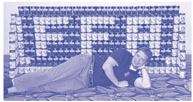
Left photo: The Canstruction winning teams at the national FFA convention received Can Hunger—Million-Can Challenge! T-Shirts for their efforts in creating the winning entry to promote the national can drive.