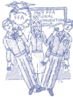
Cartoon from a 1983 FFA magazine article commemorating the 1969 decision.

The issue was debated even before 1969. Historian Debra Brookhart says the 1933 delegates nearly suspended the Massachusetts FFA Association for permitting female members on the basis that they were permitted to enroll in agricultural education (see photo at bot-