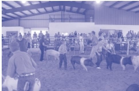
The concept for the agriscience learning lab was based on the need to locate an accessible building where students and community residents could meet for local livestock and hay shows. The facility also needed to provide space for students to feed their show animals.

now consists of a meeting room, restrooms, kitchen, feed room, as well as feeding floor space to house pigs, lambs, and goats. There is also a show and work arena. The learning lab provides students with an appropriate working and learning area to develop their knowledge in any agricultural field.