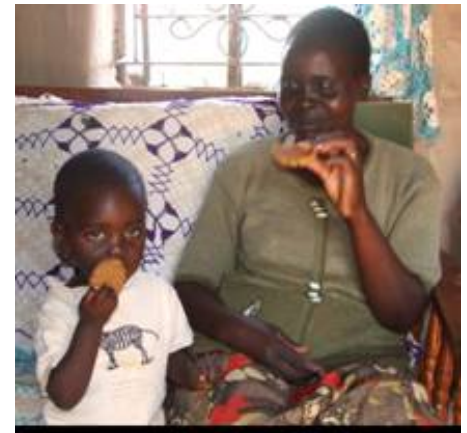
HIV-infected Kenyan mother and child enjoy high nutrition biscuit daily