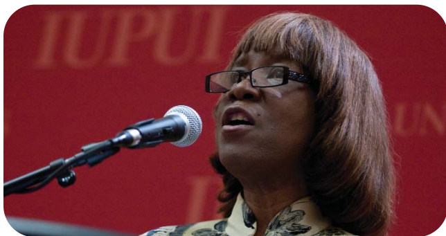
Nationally-recognized poet Patricia Smith gave the luncheon address at the 21st Annual Taylor Symposium and received a standing ovation.

"Very inspirational!" "Amazing program!" "Sincerely tremendous!"