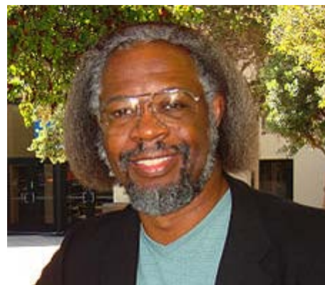
Dr. S. James Gates, Jr. John S. Toll Professor of Physics at the University of Maryland, College Park and Member, President Obama's Council of Advisors on Science and Technology

Dr. Gates' presentation will begin at 1:00 pm. This daylong celebration of research and scholarly activities at IUPUI will also include a faculty poster session; a student (graduate, professional and undergraduate) poster session, recognition of the 2011 Research Frontiers Trailblazer Award recipients, and a networking reception.