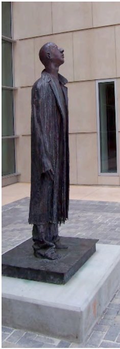
See Herron from Outside...