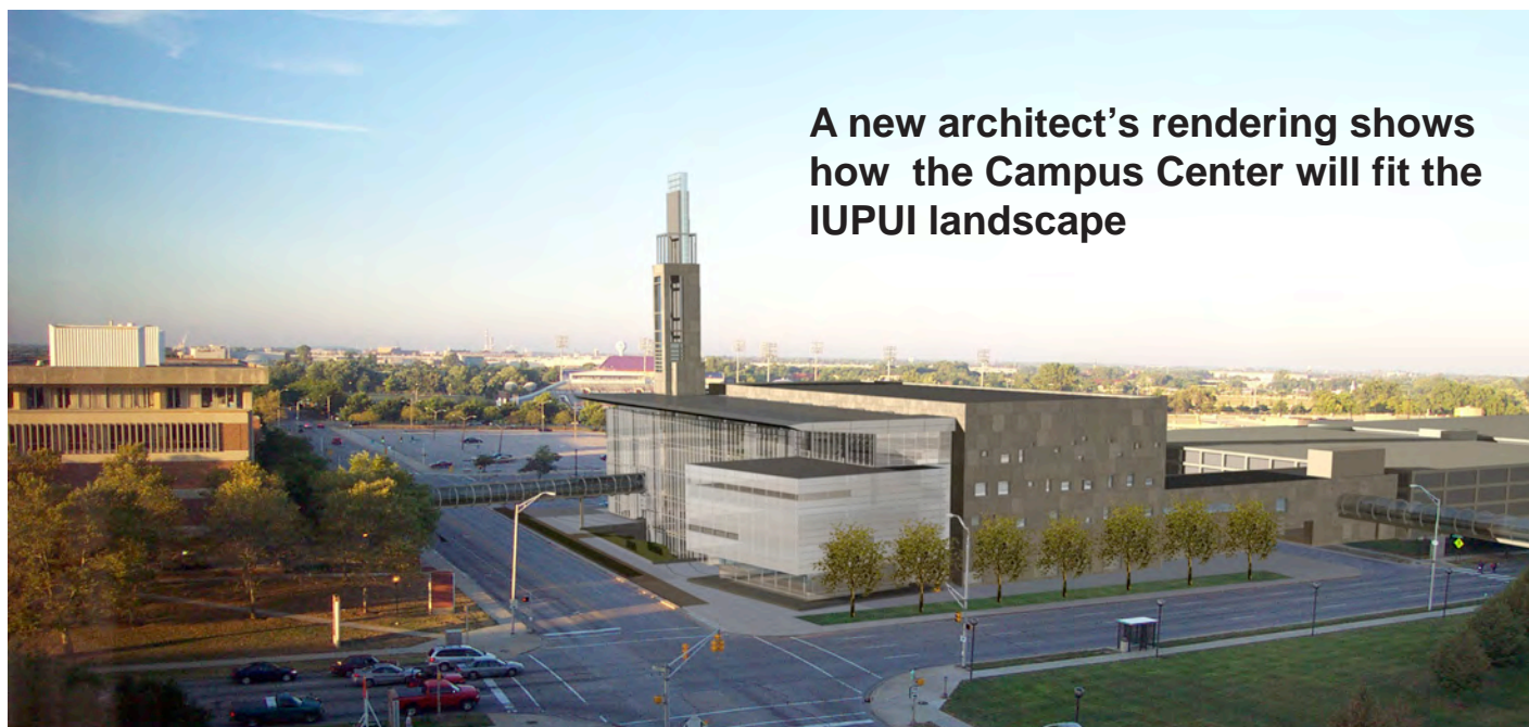
A new architect's rendering shows how the Campus Center will fit the IUPUI landscape