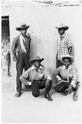
A group of "cowboys" and "cowgirls" in Kinshasa, Congo, ca 1960.