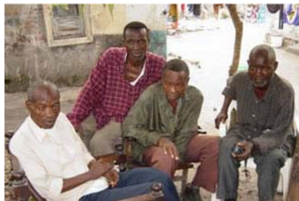
Former "tropical cowboys" interviewed by the author in "Mofewana" (Far West) Township in Kinshasa, July 9, 2005.