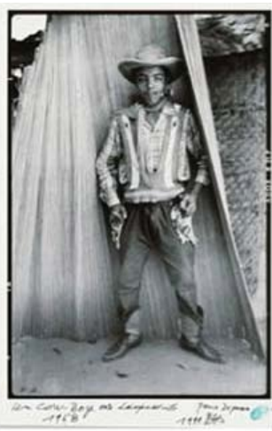
A "tropical cowboy" in Kinshasa, ca 1960.

and rituals in creating their unique culture," says Gondola. "For example, they adopted the cowboy attire, down to the cowboy hat, boots, spurs, etc., and were avid bodybuilders. Yet, they also performed traditional rituals to enhance their physical abilities and adopted some violent behaviors, such as gender violence, that conflated images of the far west and colonial violence meted out to African women."