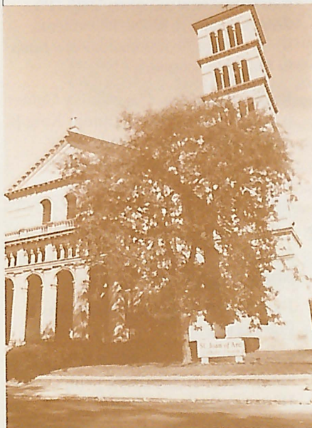
St. Joan of Arc, 1995

IPS School No. 48 is converted into an open concept school, named Louis B. Russell Jr. School.