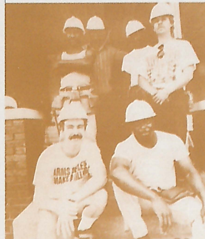
Construction Skills Training Program, ca. 1989

Coburn Place opens in summer in former IPS School 66 building, an assisted living facility for the handicapped and seniors.