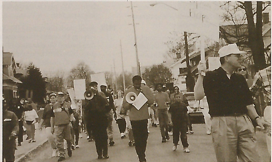
The Polis Center

1995 Residents fight the renewal of "500" liquor license.