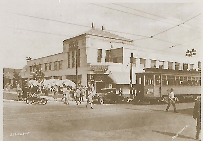
Indiana Historical Society, Bass Photo Co. Collection #216364