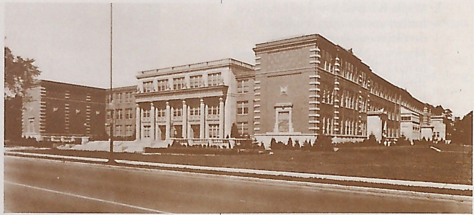
Shortridge High School

1942 Tabernacle Presbyterian purchases tract of land at 34th St. and Washington Blvd. adjacent to the church for a playground/recreation field. Govern-