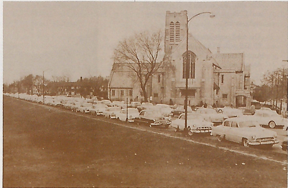
Broadway Methodist Church ca. 1950

1922 In June Our Redeemer Lutheran Church dedicates its building at Fairfield and Park avenues.