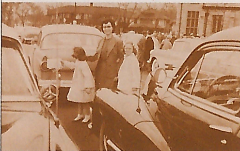
Members outside of Broadway Methodist Church ca. 1950

Watson Road Park Neighborhood Association is organized early in the decade.