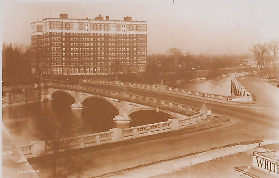
Indiana Historical Society, Bass Photo Co. Collection #200599