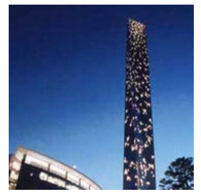
Artist: Bruce White

Fabricating at the Cliff Dwellers Club, overlooking Millennium Park in Chicago. The show runs through Nov 19. Website