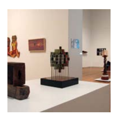
2008 Undergraduate Student Exhibition