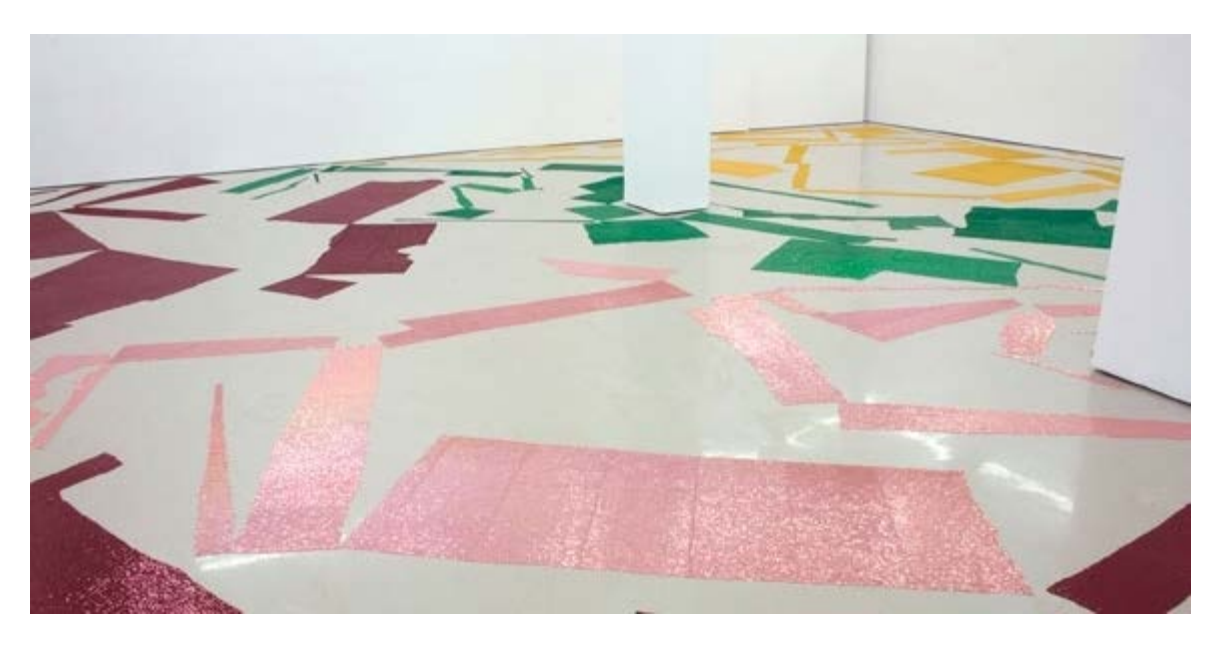
Polly Apfelbaum. Off Colour . Synthestic sequined fabric dimensions variable. D'Amelio Terras, New York. September 10 – October 23, 2010