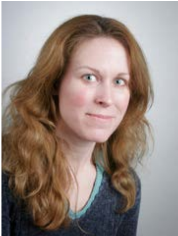
Meredith Setser