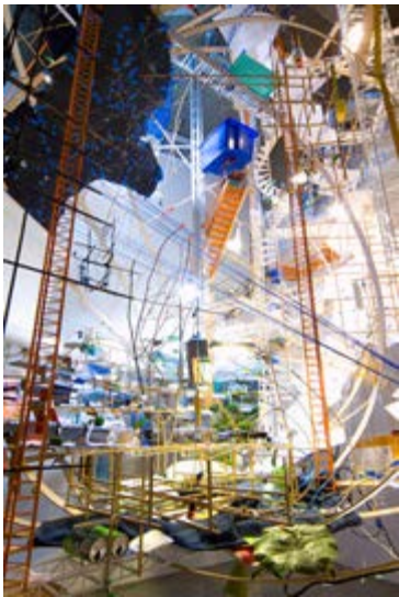
360 (Portable Planetarium)

5:30 p.m. Basile Auditorium Eskenazi Hall