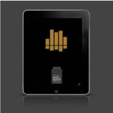
Student submission via mobile device