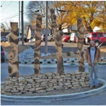
Bord with totems.