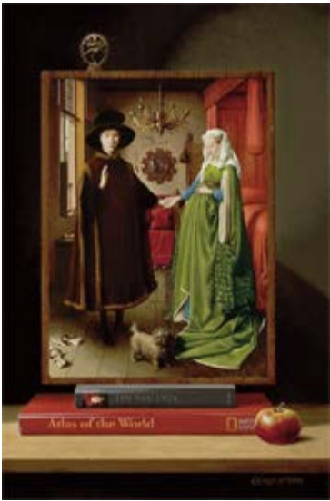
Duet of One, 36 by 24 inches, acrylic on mahogany panel