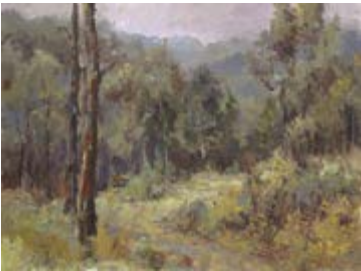
Forest Preservation, 18 x 24, oil