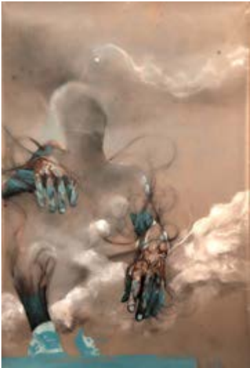
Make it Rain (Vertigo Series 2), Screen-print, Soft-pastel, Graphite, 24"x36", 2011