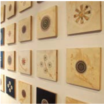
Rights of Passage (detail)

Assistant Professor Anila Agha 's work was featured at the Gallery at Penn College from January 10 through February 22. She also spoke during a Gallery Talk on the evening of the exhibition’s opening reception. The exhibition featured mixed media installations that comment on global politics, cultural multiplicity, mass media and social and gender roles. Her installations often incorporate thread as a drawing medium, which connects the multiple layers that result from the interaction of concept and process and bridges the gap between modern materials and the historical and traditional patterns of oppression and domestic servitude.