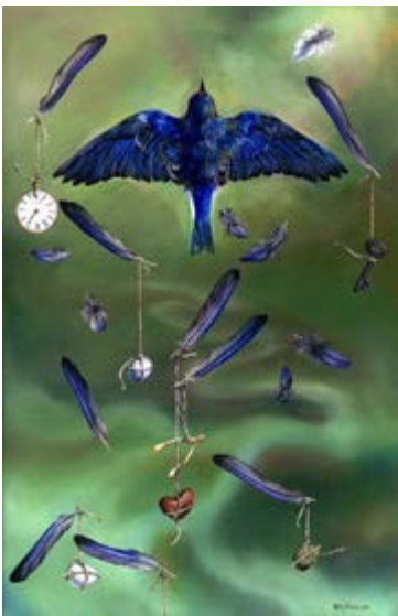
Bluebird Fall , oil on gessoed birch panel, 11.5" x 17.5" Image credit: Cathy Weber