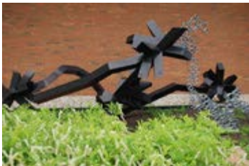
Tom Streit's The Second Assembly