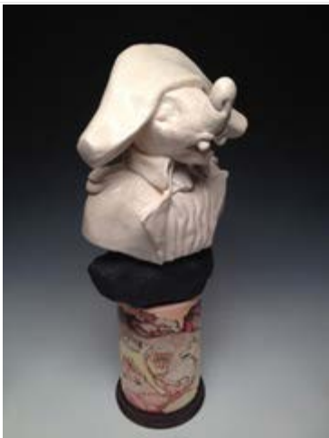
Captain Dandy

seeing an inner mental landscape rather than the physical or mundane world.