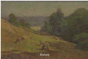
T.C. Steele's Harvest Time before cleaning. To see the "after" results, click on the image.