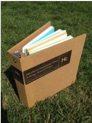
Herron visual communication students developed a long-range plan for the Hawthorne Community Center. Their case study is included in the new book, Designing for Social Change .