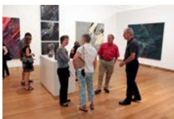
Guests enjoying our summer 2011 show.

Look for more details in the next issue of HerrOnline or on our website soon.