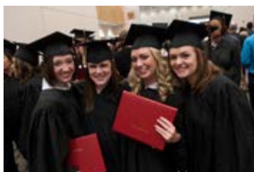
Graduation day 2010.