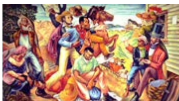
Scenes from the Underground Railroad , 1940, oil on canvas, overall: 72" x 120"