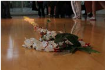
Tecumseh Trail Image credit: Danielle Riede