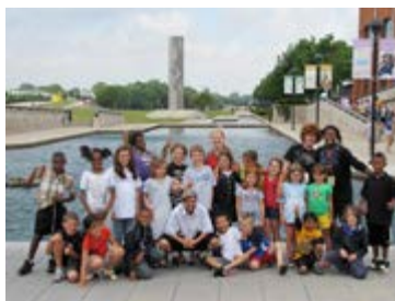
2011 youth art campers