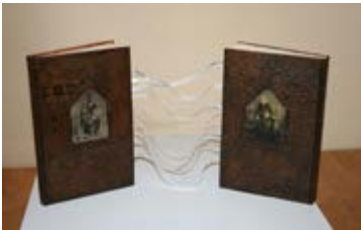
Family Secrets, mixed media, 2010