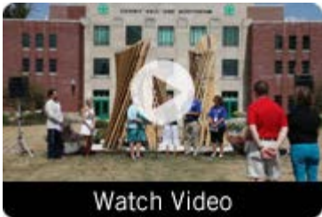
Dedication of Celebrating the Hoosier Spirit August 3.