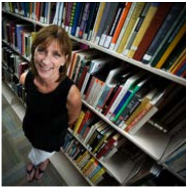
Sonja Staum