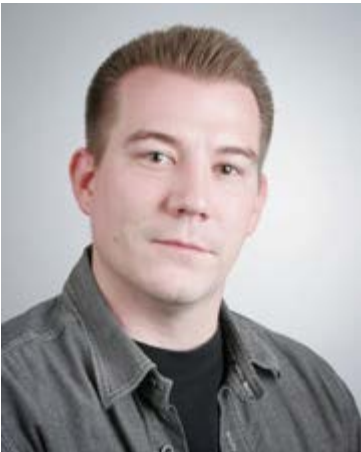
Cory Robinson