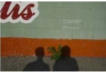
The coolest wedding portrait ever.