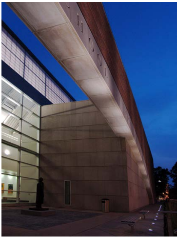
Herron School of Art and Design at night.