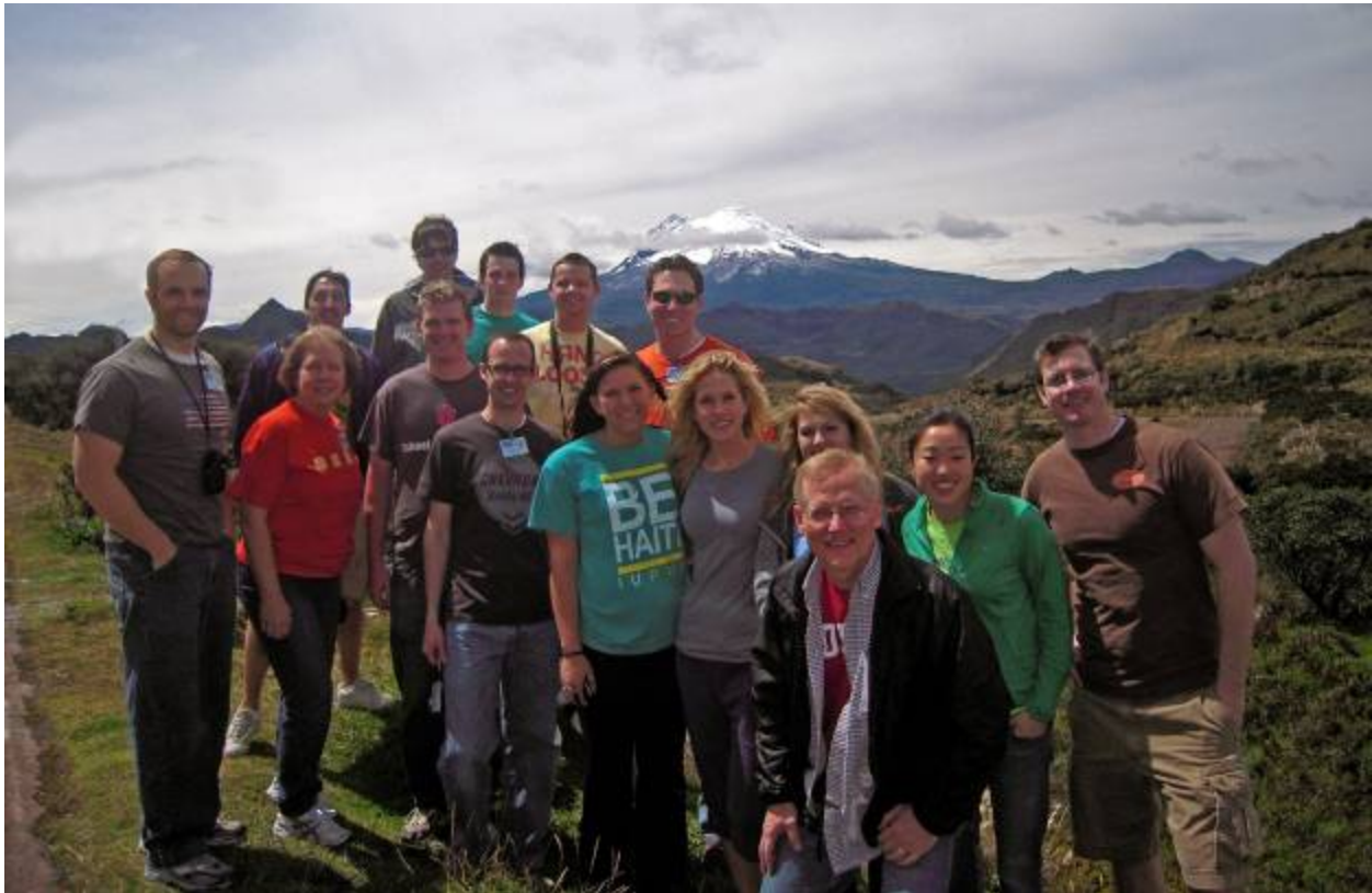
ISL volunteers in Ecuador, 2011.

For more details about IUSD's graduation, including a list of graduates who received awards and honors in 2012, go to http://www.iusd.iupui.edu/about-us/news-and-information/commencement-celebrates-224-graduates .