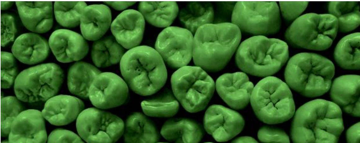
IT ISN'T EASY BEING GREEN, BUT THIS PIC WON A SPOT IN THE MED SCHOOL'S ART EXHIBITION

More women than men compose incoming DDS class for first time in IU dental school's 133-year history