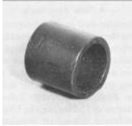
A piece of copper tubing believed to be from Charles Lindbergh's famous plane

PIPE DREAMS. The fabled Spirit of St. Louis once touched down at the IU dental school.