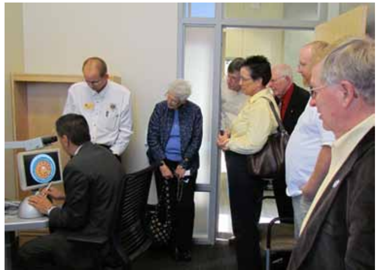
The Eyesi Indirect Ophthalmoscope simulator is demonstrated for the Indiana Lions Eye and Tissue Bank board of directors at the Eugene and Marilyn Glick Eye Institute.

“We had four surgical stations for this exercise. Residents practiced different steps of cataract surgery initially using pig eyes: capsulorhexis,