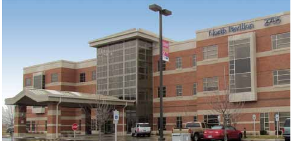
The North Pavilion at Witham Health Services in Lebanon, the location of the newest satellite Glick Eye Institute.

“Previously, many patients were seeking treatment outside of our