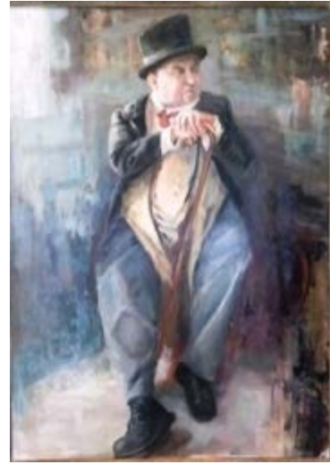
The Old Shopkeeper Image courtesy Lois Eskenazi

Surprising Successes will be a retrospective of works by artist/philanthropist Lois Eskenazi.