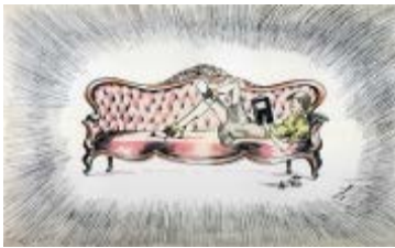
Pen and ink drawing by Edith Moore from 1944