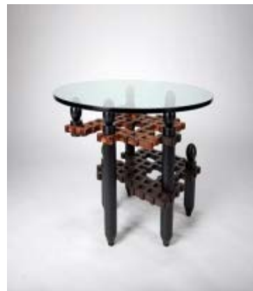
Spatial Table , Phil Tennant