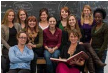
First art therapy students at Herron signal an historic step for the profession in Indiana.