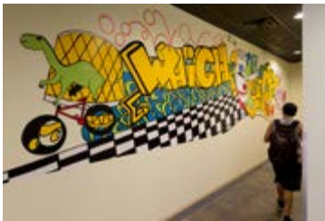
The new mural at Which Wich