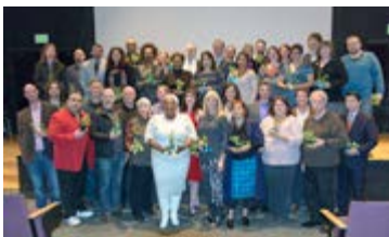
This year's Creative Renewal fellows