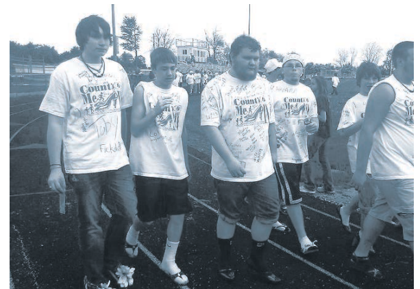
Ridgemont FFA members "walk a mile in her shoes" to raise awareness of gender-based violence and support a local women's shelter.

On the last lap of the mile, 100 percent of students joined the men on the track to represent unity in the fight against domestic violence. The walkers raised more than $3,500 to support a local women's shelter.