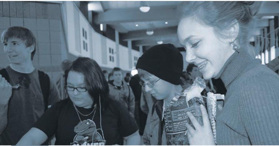
Red Wing FFA members distribute fruit in Locker Bay.