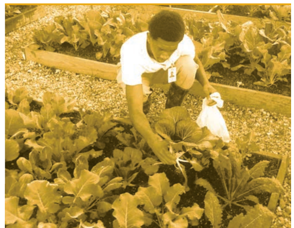
Ponchatoula FFA members raised strawberries as part of their Greenwave Growers Cooperative.

After expenses, the members profited $10,000 and developed money management and agribusiness skills.