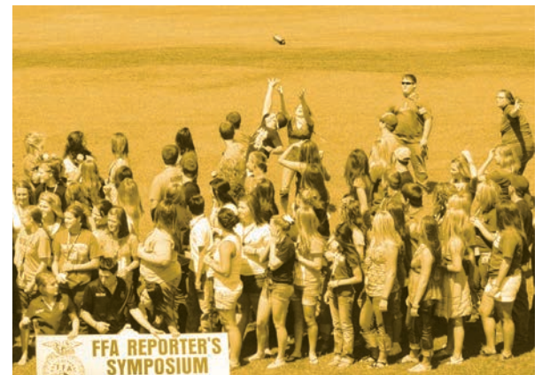
FFA members attend a Cushing FFA event geared to broaden chapter reporter skills.

Participants paid $30 to cover their food, a folder of information, T-shirt and flash drive. Miss Oklahoma even stopped in to give a presentation.