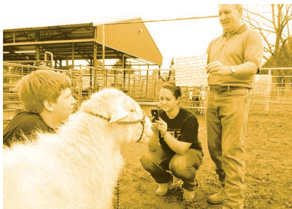
Flippin FFA members create posters with QR codes to educate about agriculture.

The use of social networking and technology allowed members to reach new audiences and promote their research and hard work.