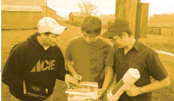
Ridgemont FFA members developed an educational Farmers Feeding All program.

Twelve members and two teachers attended the National Youth Leadership Conference in Atlanta, Ga., to give three rural safety presentations to 425 students. Members continued to give educational seminars at leadership events across the country and informed and inspired more than a thousand individuals.