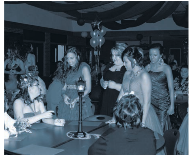
Shenandoah FFA members hosted a spring “Adventures Under the Sea” event for developmentally disabled community members.

Shenandoah FFA was rewarded an $8,798 grant and was recognized by the state FFA association with the Success for the USDA Living to Serve initiative. The chapter plans on making the event bigger next year and will continue to reach out to people with disabilities in the community.