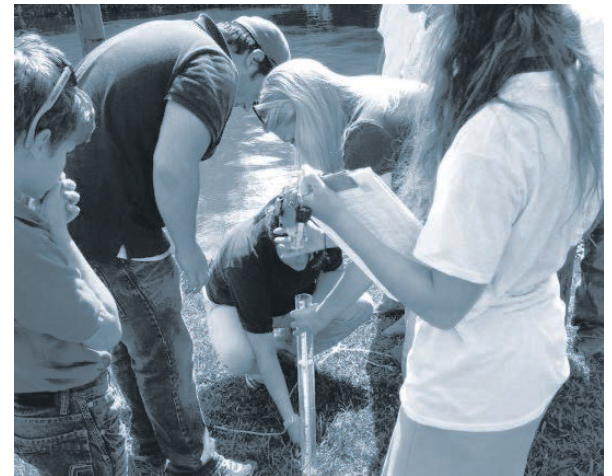
Ponchatoula FFA members test water quality.

For the environment, members teamed with a wetland specialist to plant more than 2,000 wetland trees in high-erosion areas.