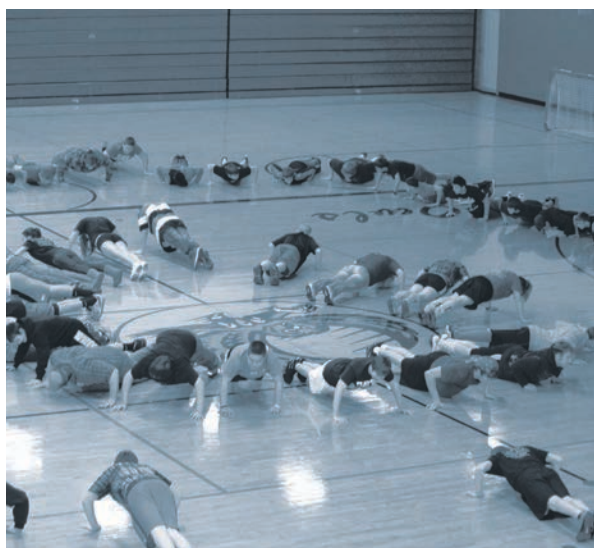
Marshall FFA members participate in a Fitness For All event.

They put that money management experience to good use during the Poinsettia Sale. After growing 550 poinsettia plants, members set prices, developed a marketing plan and tracked sales to ensure a profit was made. Other projects focused on giving back to the community through agricultural presentations and a used shoe drive that donated shoes to a local nonprofit group.