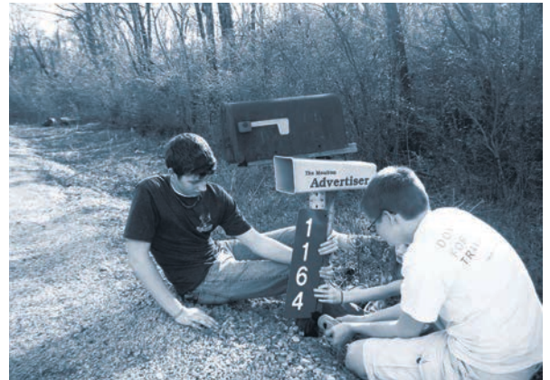
Lawrence County FFA members install reflective address signs to aid local residents in emergencies.

The chapter continued the relationship with local veterans by attending the Veterans Spring Fling and constructing 10 projects to donate to the home's auction. The items raised $180 for the veterans to use for games and materials.