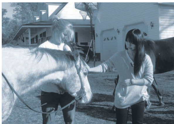
Rosewood FFA members hosted members from the Future Farmers of Japan.

Approximately 250 history and agriculture students learned from the Japanese students who spoke to their classes about the global reach of agriculture. Students learned about time management, hospitality and respect for other cultures.