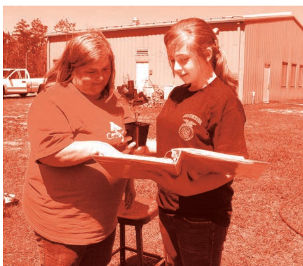
Creekside Junior FFA members created earth-friendly garden programs to support the community.

There's nothing like shooting hoops to drive competition and remind students of the importance of their health. In addition to many other successful activities, the chapter sponsored a school-wide 4-on-4 basketball tournament.