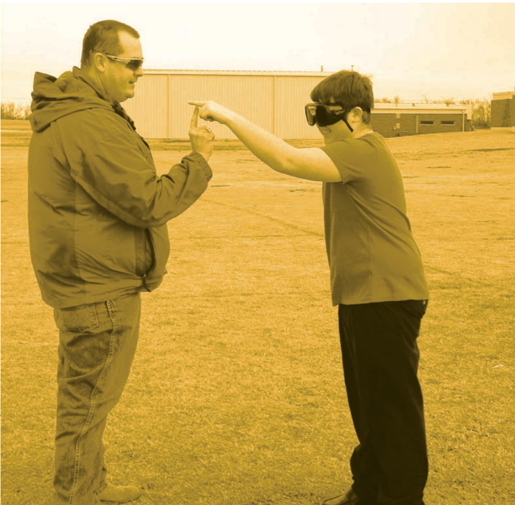
Vinita FFA members simulate distracted and impaired driving to influence members to make smart decisions behind the wheel.