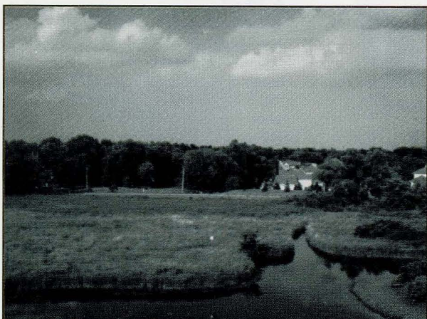
Natural preserve area behind the Conference Center.

Skills Building sessions are being designed to be of value to both novice and seasoned grantmakers. Participants may choose