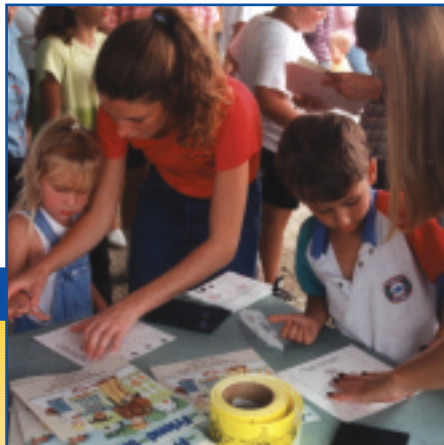
Working with the local sheriff's department, members fingerprinted more than 220 children.