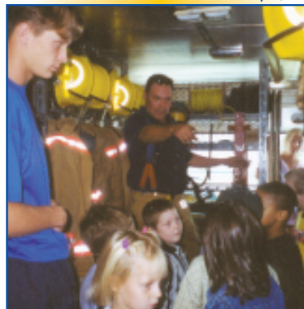
Cissna Park FFA Chapter, Illinois