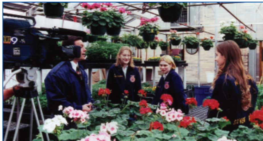
Stevens Point FFA Chapter, Wisconsin

—Conococheague/James Buchanan FFA Chapter, Pennsylvania