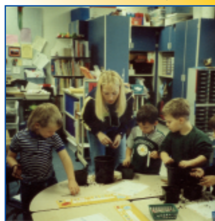
Yelm FFA Chapter, Washington