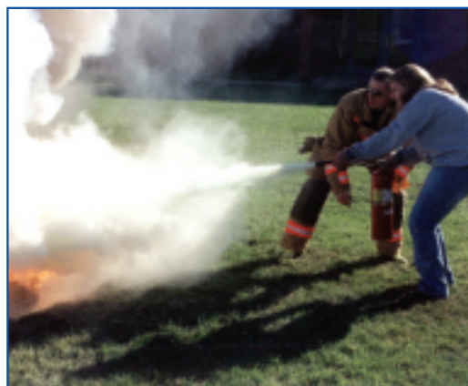
Greenville FFA Chapter, Ohio