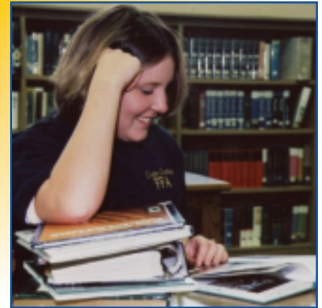
East Clinton FFA Chapter, Ohio