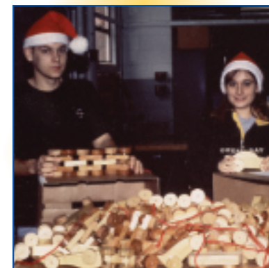
Bowling Green FFA Chapter, Ohio