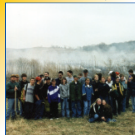
Mt. Carroll FFA Chapter, Illinois