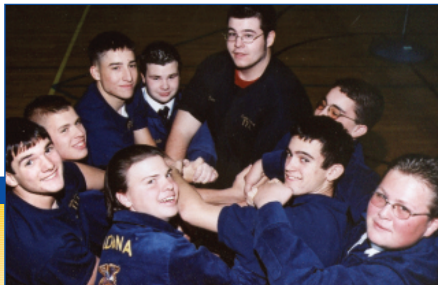
Involving new members is one of the main areas on which the Clinton Central FFA officers focus their efforts.