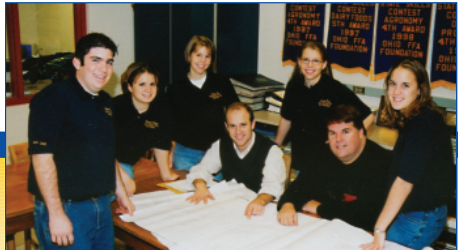
FFA officers plan a wide array of activities to provide something of interest for everyone.