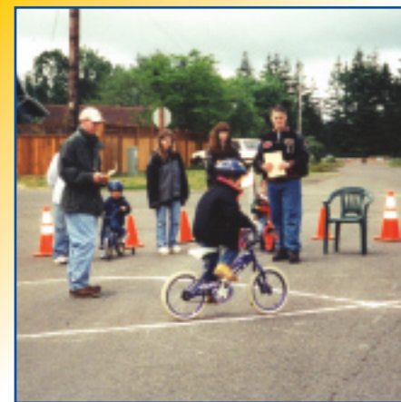
Yelm FFA Chapter, Washington