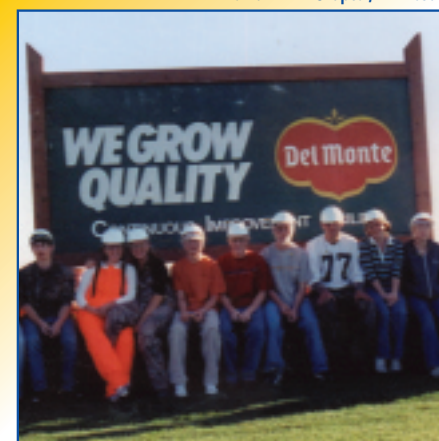
Stevens Point FFA Chapter, Wisconsin