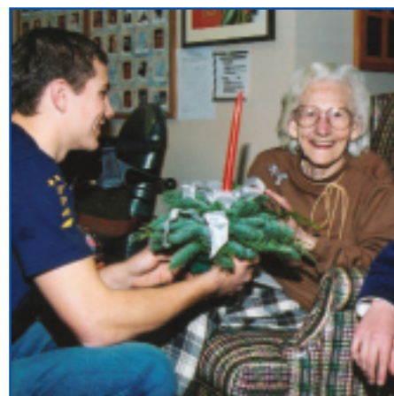
Perrydale FFA Chapter, Oregon