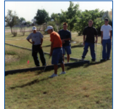
Imperial FFA Chapter, Nebraska