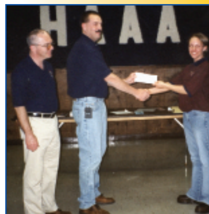
Heritage FFA Chapter, Indiana