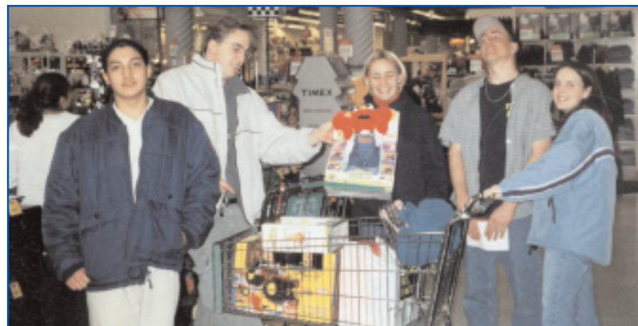
Yelm FFA Chapter, Washington