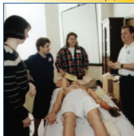
Otsego FFA Chapter, Ohio