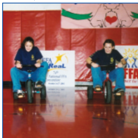
Perrydale FFA Chapter, Oregon