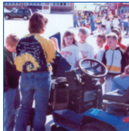
Monticello FFA Chapter, Iowa