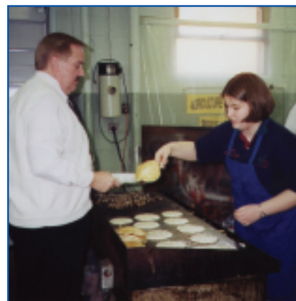
East Clinton FFA Chapter, Ohio