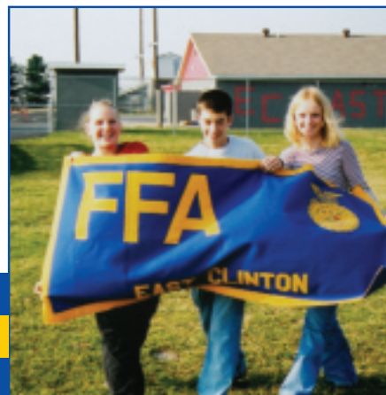
East Clinton FFA Chapter, Ohio