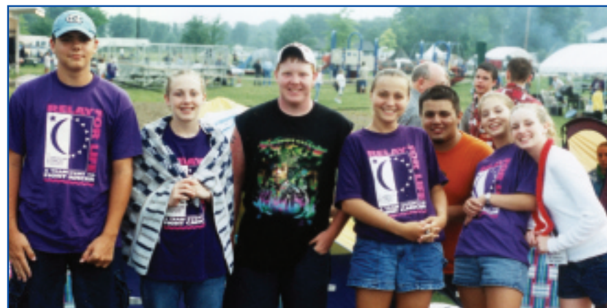
Switzerland County FFA Chapter, Indiana