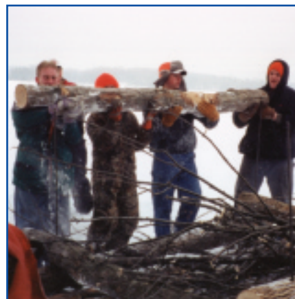
Bloomer FFA Chapter, Wisconsin