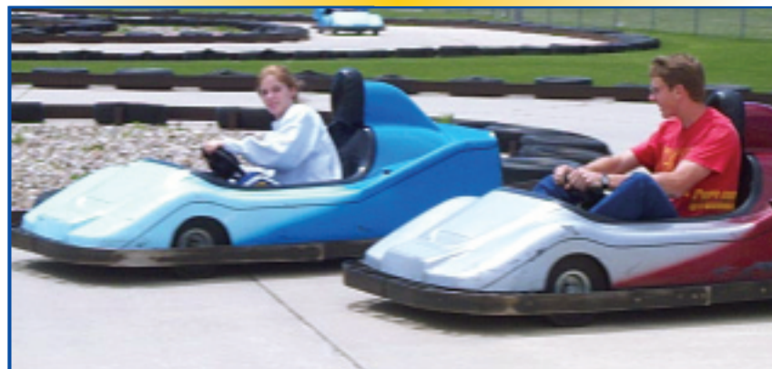
Benton Community FFA Chapter, Iowa

Chapters provided the remaining photography.