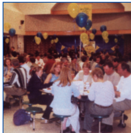
Monticello FFA Chapter, Iowa

Applying for recognition through the National Chapter Award program is the "icing on the cake." Recognition from the state and national organizations rewards students for their hard work and brings added prestige to the chapter.