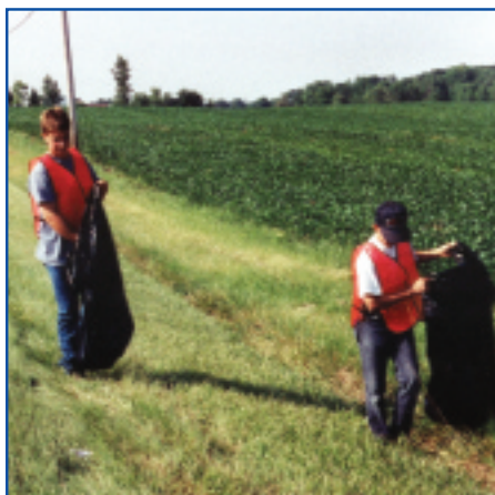
Greenville FFA Chapter, Ohio