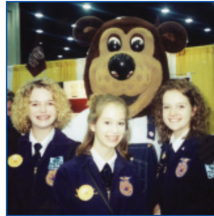
Portland FFA Chapter, Tennessee