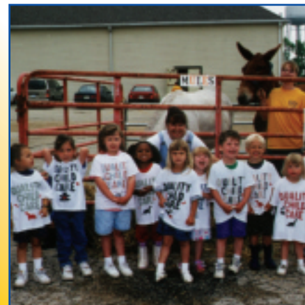
Mt. Carroll FFA Chapter, Illinois