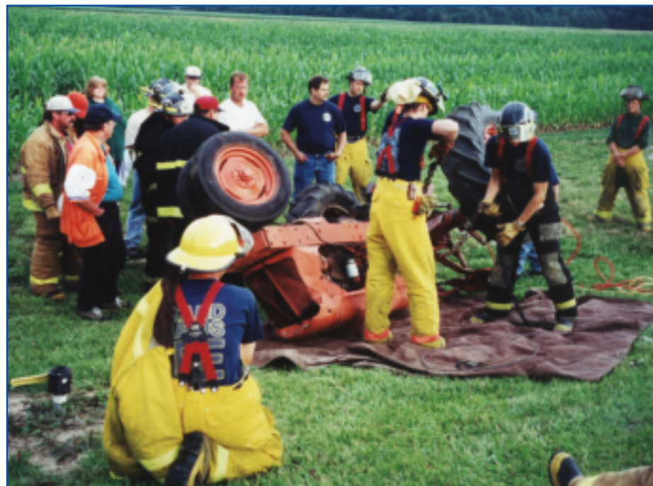
Otsego FFA Chapter, Ohio