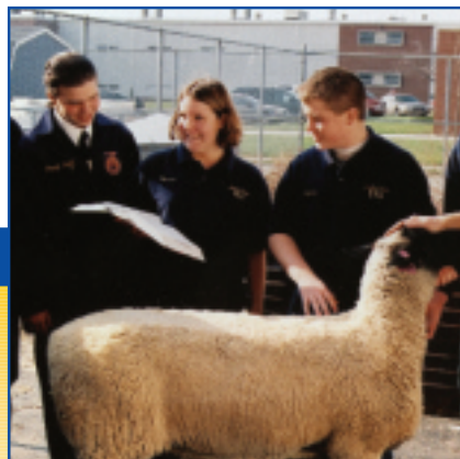
Officers encourage member participation in the chapter's two livestock shows.