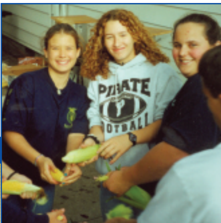
Perrydale FFA members prepare corn for their annual community corn feed.