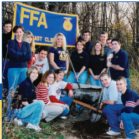
East Clinton FFA members worked with others in the community to develop a community wetlands and nature area.

Chapter leaders stress the importance of providing activities for all students and caring for each individual. "Our FFA chapter is like a big family," says Fliehm. "We look out for one another and help our members develop life skills. FFA can do so much by helping students develop their self-confidence and teaching them how to succeed in the real world. Even when students don't reach their goals, they learn valuable lessons just by participating in the process."