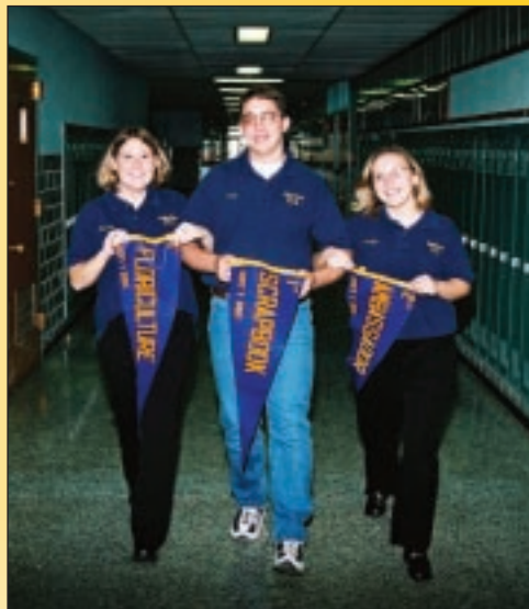
Clinton Central FFA Chapter, Indiana