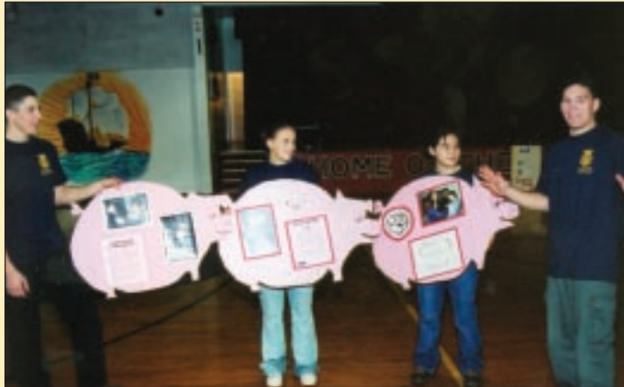
Perrydale FFA Chapter, Oregon