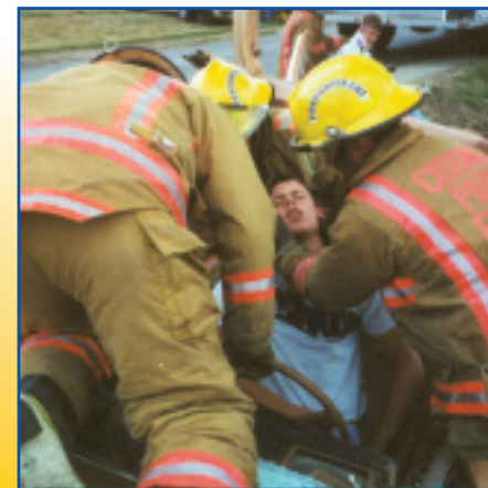
Cissna Park FFA Chapter, Illinois