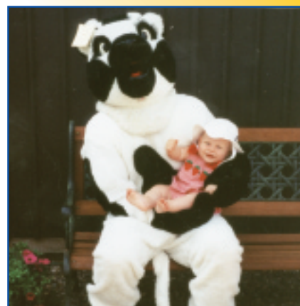
Bloomer FFA Chapter, Wisconsin