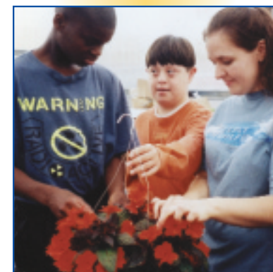
Dyersburg FFA Chapter, Tennessee