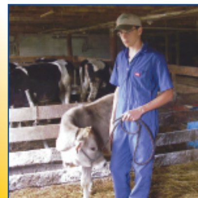
Middleburg FFA Chapter, Pennsylvania