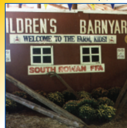
South Rowan FFA Chapter, North Carolina