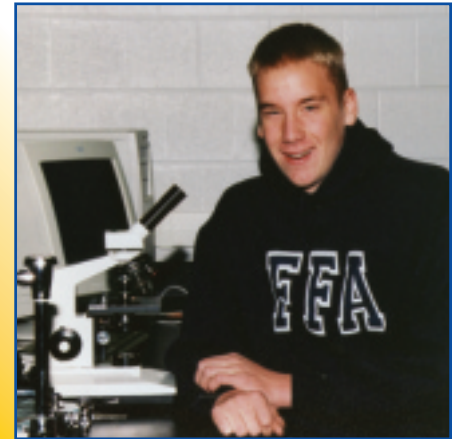
East Clinton FFA Chapter, Ohio