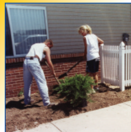
Imperial FFA Chapter, Nebraska