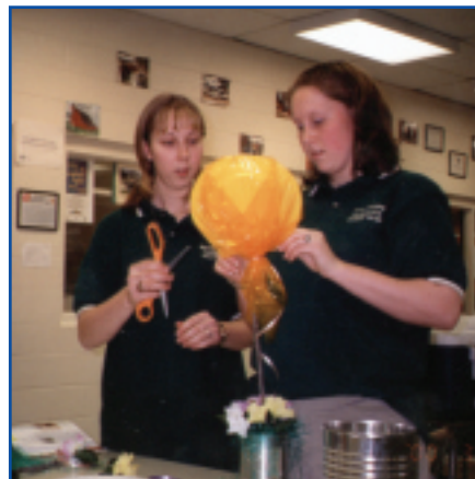
Heritage FFA Chapter, Indiana