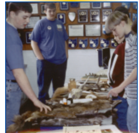
Bowling Green FFA Chapter, Ohio