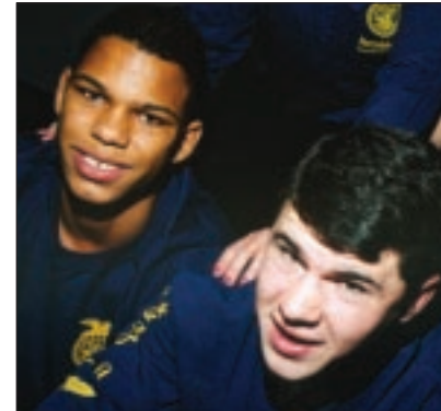
Perrydale FFA Chapter, Oregon