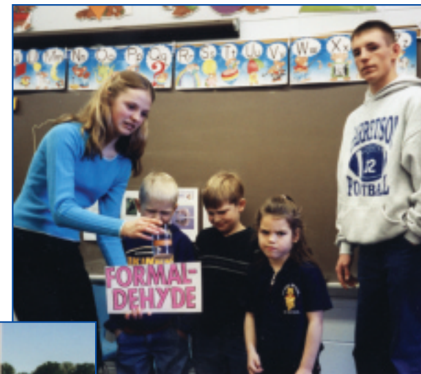
Garretson FFA Chapter, South Dakota