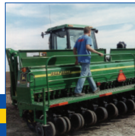
Imperial FFA Chapter, Nebraska