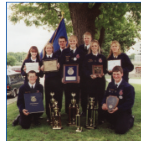
Stevens Point FFA Chapter, Wisconsin