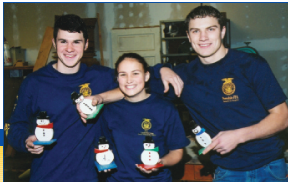
FFA members display small, decorative items they made from wood to give seniors at a local retirement community during the holidays