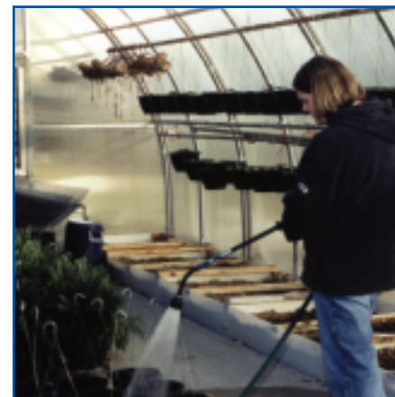
Portland FFA Chapter, Tennessee