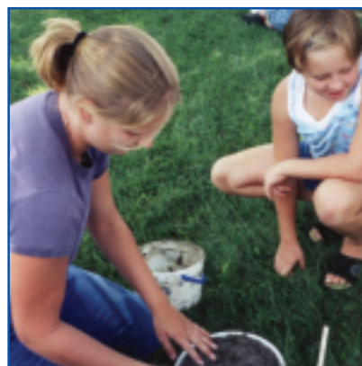
Otsego FFA Chapter, Ohio