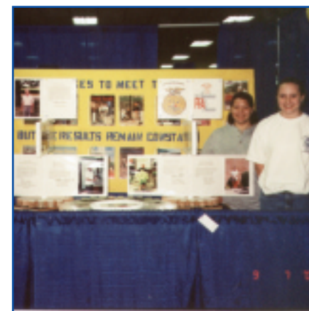
Portland FFA Chapter, Tennessee