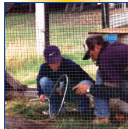
Perham FFA Chapter, Minnesota