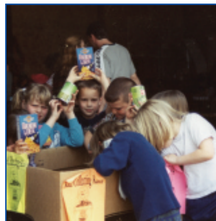
Heritage FFA Chapter, Indiana