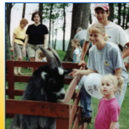
Stevens Point FFA Chapter, Wisconsin