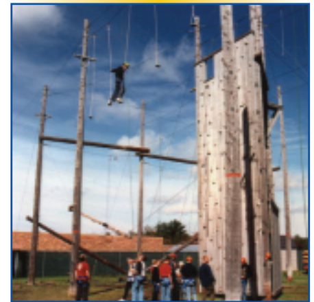
Stevens Point FFA Chapter, Wisconsin