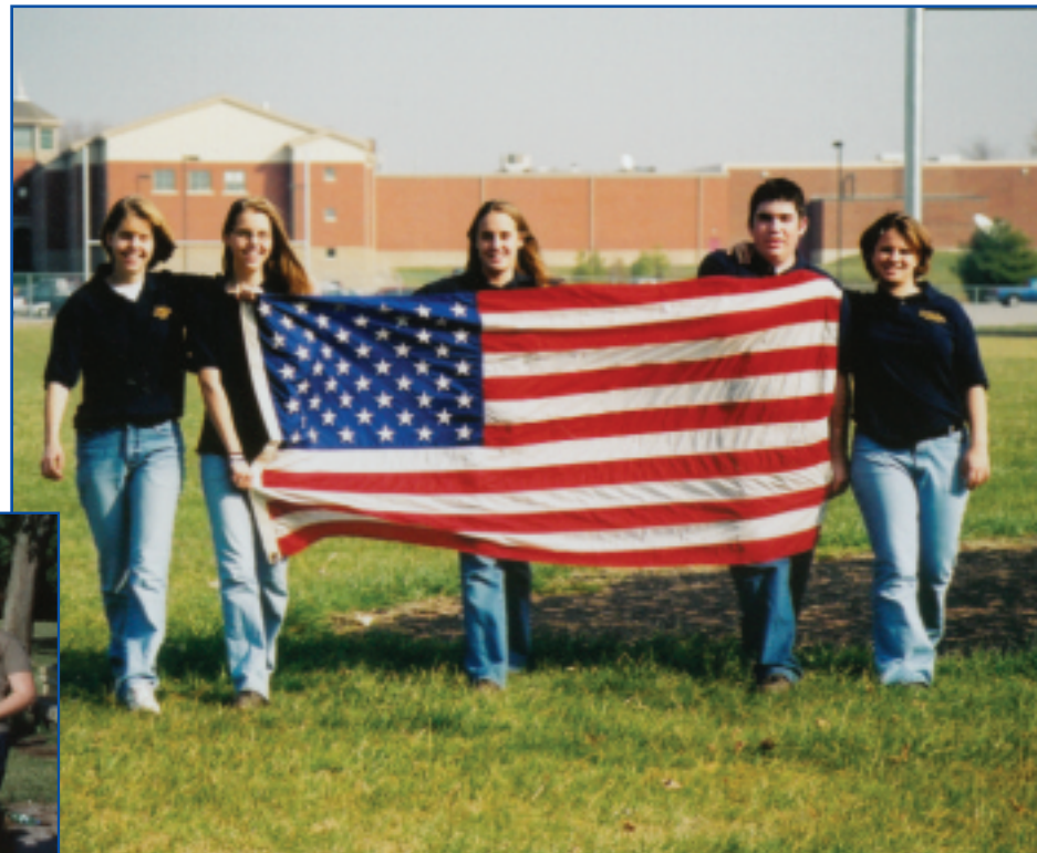
Working together, East Clinton FFA members landscaped a city park.