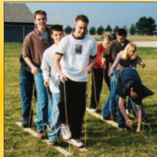
East Clinton FFA Chapter, Ohio