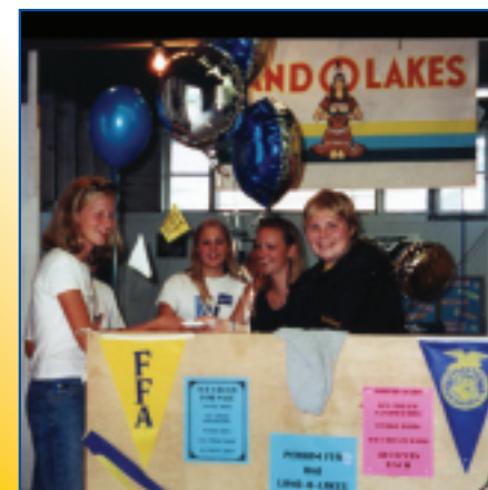
Perham FFA Chapter, Minnesota