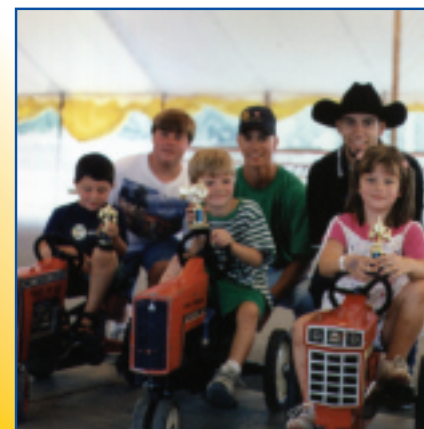
Otsego FFA Chapter, Ohio