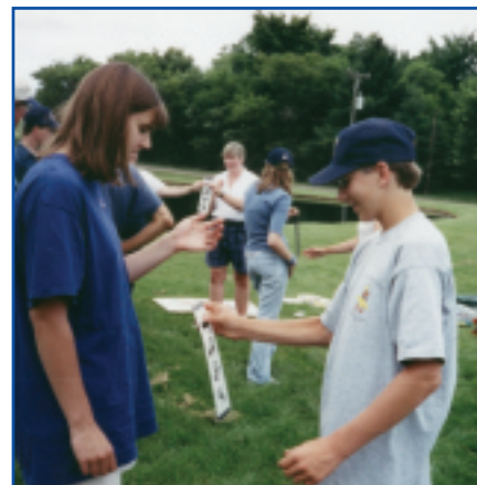
Stevens Point FFA Chapter, Wisconsin