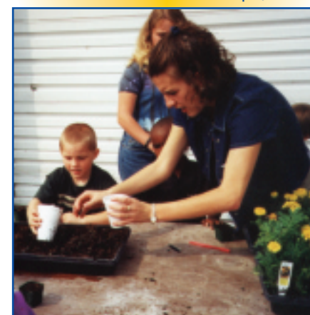
Switzerland County FFA Chapter, Indiana