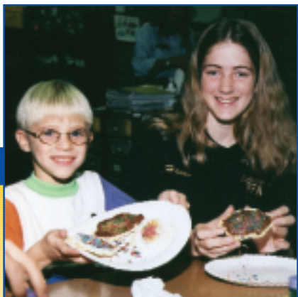
FFA members conducted several holiday service activities with elementary students, including making cookies.

All of these activities were student-driven and were developed, managed and implemented by chapter members. The key to getting the ball rolling was a pro-active chapter officer team that worked diligently to develop a challenging POA and then continuously encouraged chapter members to become involved.