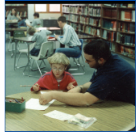
Franklin FFA Chapter, Nebraska