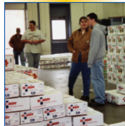
Switzerland County FFA Chapter, Indiana

📍 Switzerland County FFA Chapter, Indiana