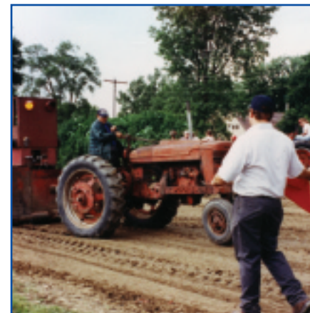
Adams Central FFA Chapter, Indiana