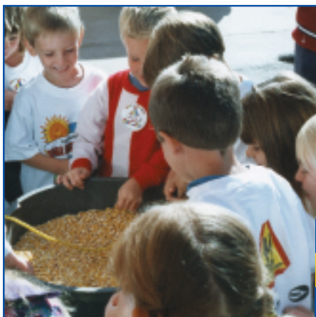
Franklin FFA Chapter, Nebraska