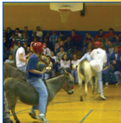
Middleburg FFA Chapter, Pennsylvania