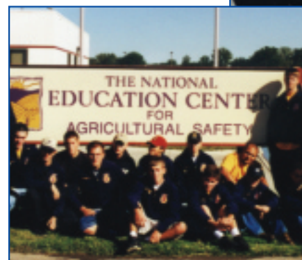
Mt. Carroll FFA Chapter, Illinois