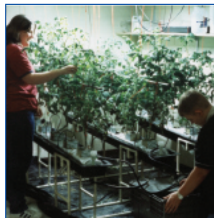
Franklin FFA Chapter, Nebraska