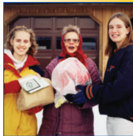
Garretson FFA Chapter, South Dakota