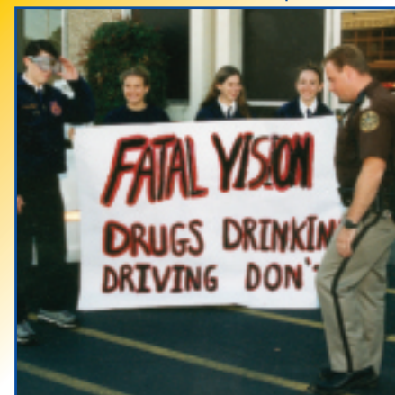
Perrydale FFA Chapter, Oregon