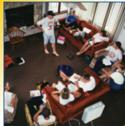
Imperial FFA Chapter, Nebraska