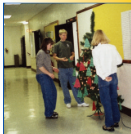
McCook Central FFA Chapter, South Dakota