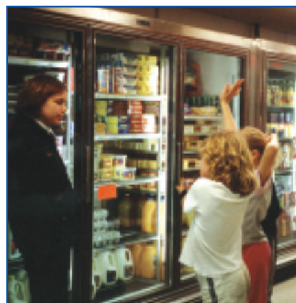
Granton FFA Chapter, Wisconsin

📍 South Rowan FFA Chapter, North Carolina