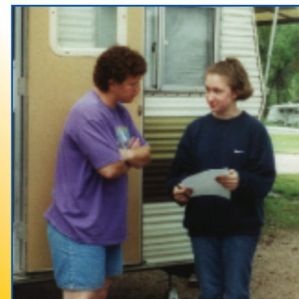
Franklin FFA Chapter, Nebraska