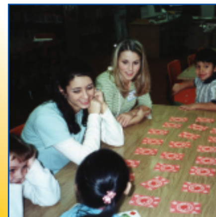
South Rowan FFA Chapter, North Carolina