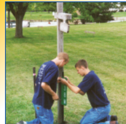
Cissna Park FFA Chapter, Illinois