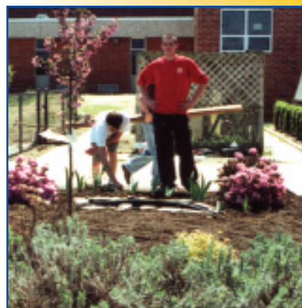
Conococheague/James Buchanan FFA Chapter, Pennsylvania