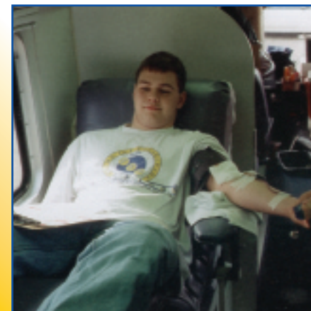
Garretson FFA Chapter, South Dakota