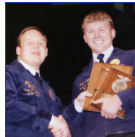
McCook Central FFA Chapter, South Dakota