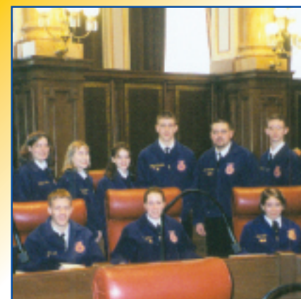
Cissna Park FFA Chapter, Illinois