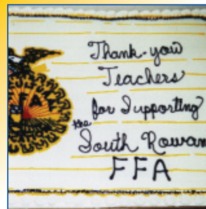
South Rowan FFA Chapter, North Carolina