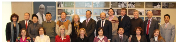
(图为项目委员会全体 成员合影)