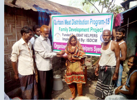
Meat distribution in Syedpur

More than ten thousand families received meat from your Udhiya /Qurbani contributions. Meat was distributed in the following cities: Chittagong, Khulna, Rangpur, Syedpur, Bogra, Mymensingh, Gaibandha and Narayan Ganj. Seventy-one cows and one hundred and sixty one goats were slaughtered on Eid-ul-Adha. Thank you for your compassionate contributions!