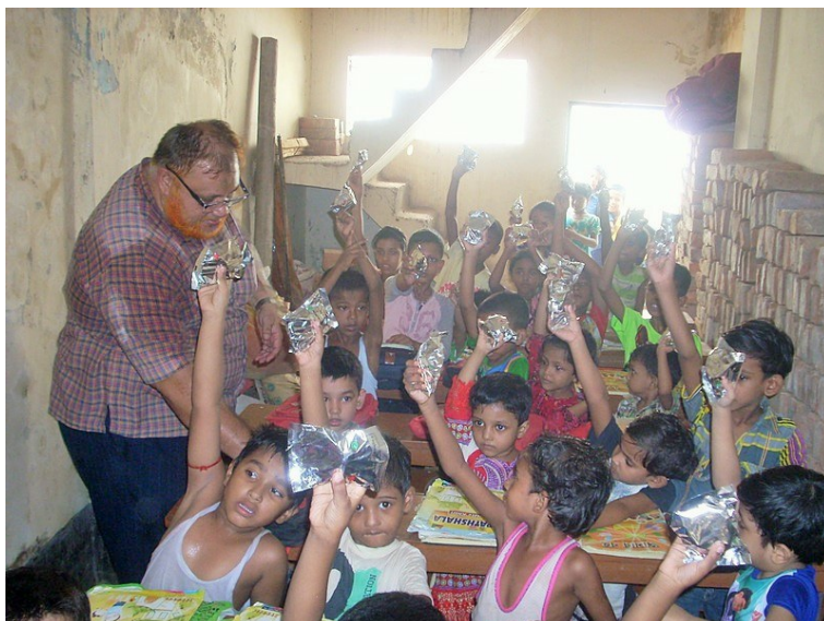
Euglena's nutrition program for OBAT's students

The Japanese company, Euglena has now initiated its nutritional biscuits distribution in OBAT's BLS school as well as Mirpur